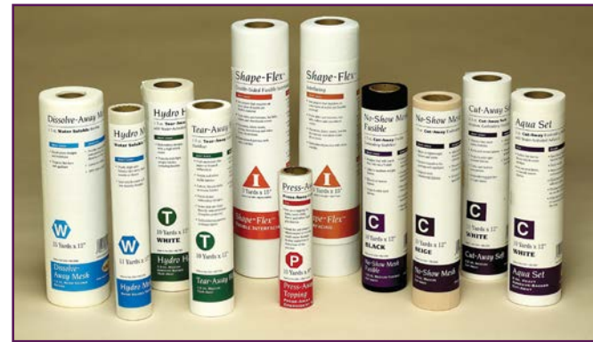
Baby Lock Stabilizer