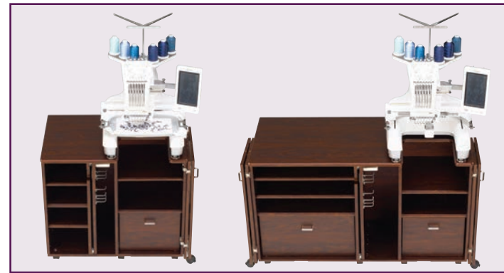
Embroidery Plus and Embroidery Pro Plus Koala Studios