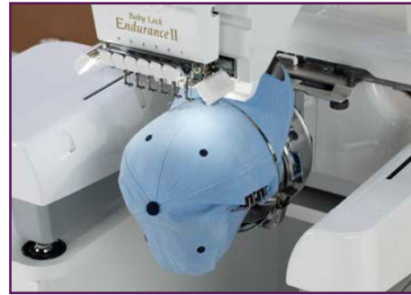
Advanced Cap Frame Set

No matter where your creativity takes you, Baby Lock has an optional accessory that gets you there.