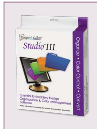
Designer's Gallery Studio III Cataloging Software