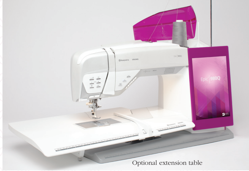
Optional extension table

Durable, quiet and extremely stable, this machine stands still so you can make history.