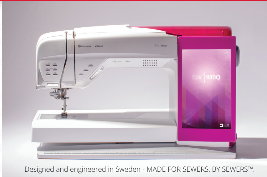
Designed and engineered in Sweden - MADE FOR SEWERS, BY SEWERS™.