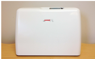
Hard Shell Case Included!

All Quilt Shop Sewing Machine models include a 25 Year Factory Warranty!