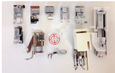
Up to 11 Sewing & Quilting Feet Included!