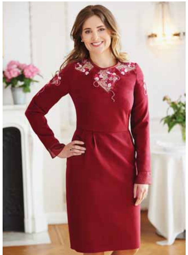
Tips & Hints on how to make the DESIGNER RUBY Royale™ Dress are available on husqvarnaviking.com .