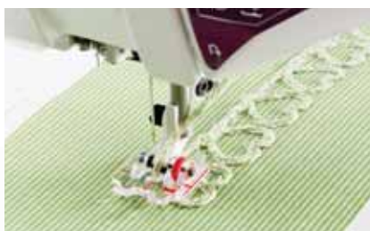
The heart shaped border on the pillow was made with the optional Yarn Embellishment Foot.

The DESIGNER™ Selection offers more than 1000 beautiful stitches and lettering, more than 50mm (2") wide with Side Motion Stitches, plus hundreds of high quality embroidery designs.