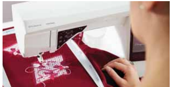
The Automatic Jump Stitch Trim feature trims the jump stitches in embroidery and pulls the thread ends to the back for hassle-free, expert results.

With the exclusive built-in and fully automatic HUSQVARNA VIKING® deLuxe™ Stitch System you will achieve stunning stitch results on both sides of the fabric. It allows you to really enjoy the creative process, instead of spending time on adjusting machine settings and test sewing. Even on sheer materials and with challenging specialty threads you will get impressive results!