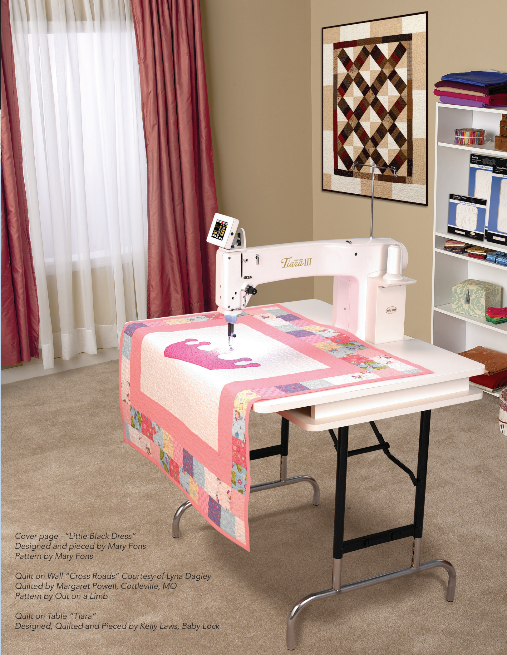
Cover page – "Little Black Dress" Designed and pieced by Mary Fons Pattern by Mary Fons

Enjoy fewer bobbin changes with the largest bobbins available in quilting (up to 40% larger than standard bobbins). Plus, with variable speeds on the electric bobbin winder, you can easily wind thread of different types and weights.