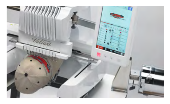
Wide Cap Frame Set 14" x 2-3/8" (ENCFS)

The love of sewing membership will help you get the most out of our Baby Lock Valiant machine. Enjoy four years of unlimited access to sewing tutorials, comprehensive service and unique savings opportunities.