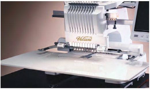
Extension Table (ENTABLE)