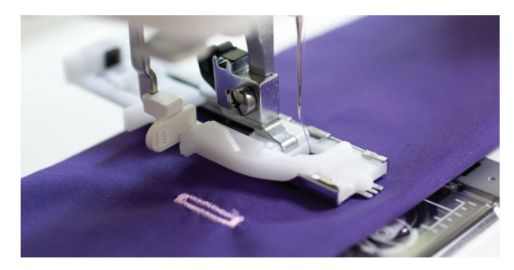
Built-In Buttonhole - With the buttonhole foot, your one-step buttonhole will be automatically sized to match your button every time.