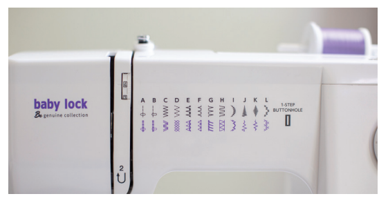
25 Stitches - Add your unique touch to every project with a library of stitches that sets everything apart!