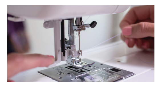
Advanced Needle Threader - With just a few simple motions, your needle is threaded and ready to use. There's no guesswork, no near-misses and no frustration!