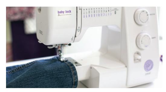
Free-Arm Sewing - Want to hem pants, work on a sleeve or sew in a hard-to-reach area? No problem. Just easily remove the flatbed and use Zeal's free arm.