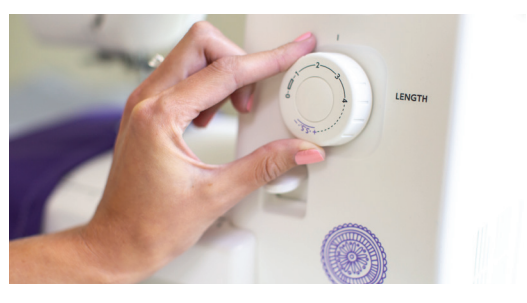
Variable Stitch Length and Width - Adjust the length and width for variety or specific techniques like basting or gathering.