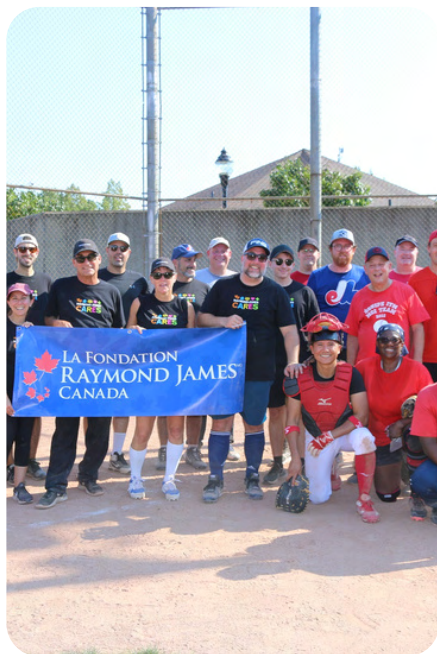
The MCI Lobes claimed victory over the Raymond James Bulls in a surprise upset.