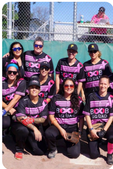
The Boob Squad softball team