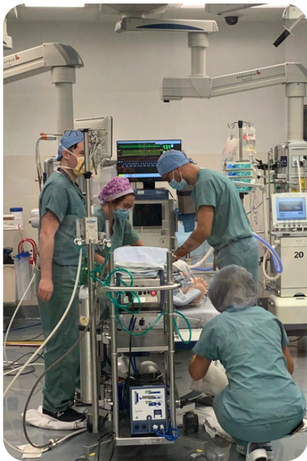
MUHC staff work in the operating room.