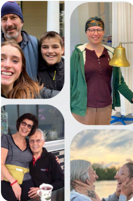
The 2023 World Cancer Day campaign ambassadors.