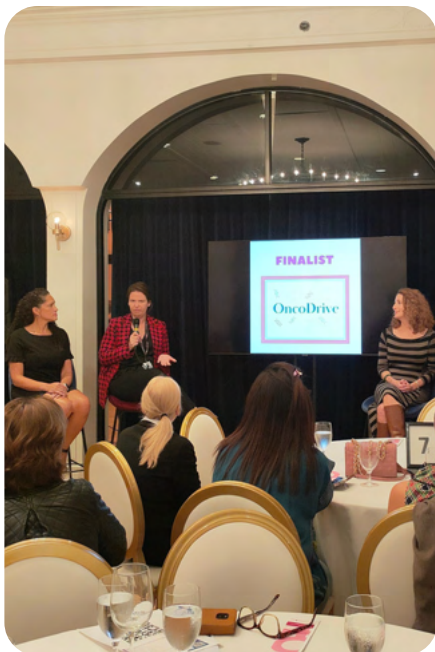
Members of the MUHC Foundation's staff pitch three inspiring women's health projects to 100+ Women Who Care Montreal.