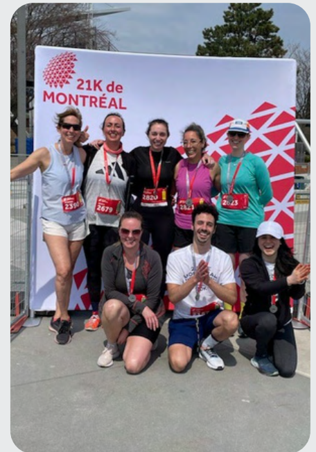
The Chronic Viral Illness Service running team show off their medals.

With your support, Run for a Reason was a great success.