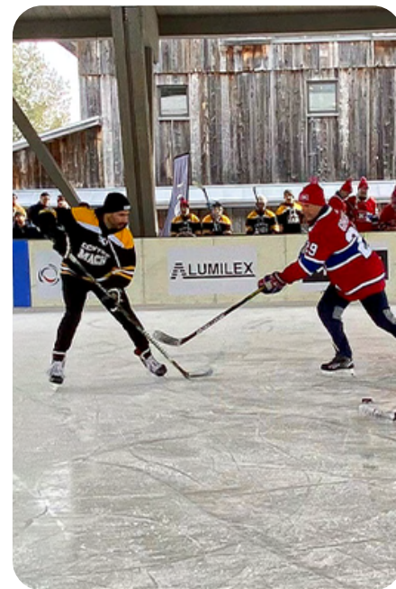
Habs alumni and generous donors go head-to-head in a friendly outdoor game.

The $300,000 raised will support the McGill Interdisciplinary Initiative in Infection and Immunity (MI4). For all involved, the true winners are the patients who will one day benefit from new innovations in infectious disease medicine.