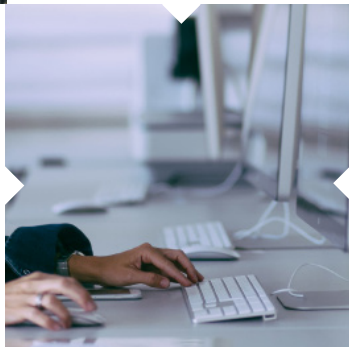
Health & Resilience