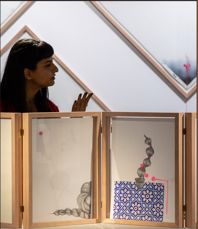
Nooks of Power (2023) by Sophiya Khawja, Critical Practice Programme 2022.