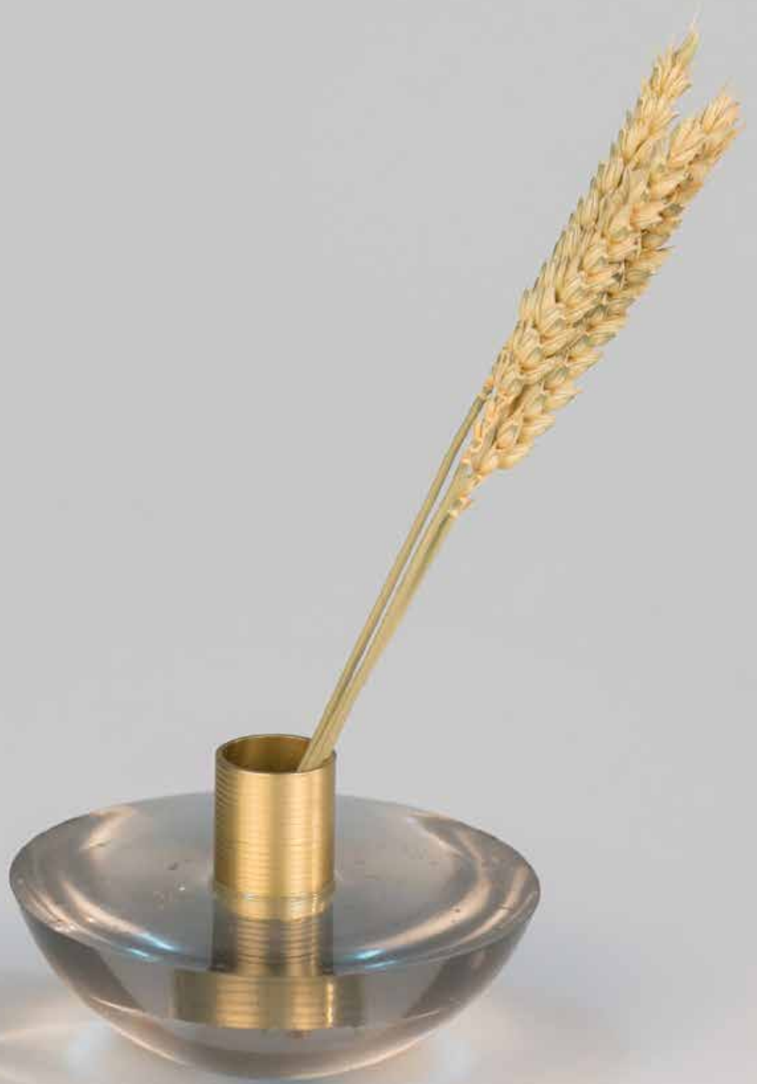
Alya Al-Eghfeli. Host Vessel . 2018. Part of the Tanween + collection. 11 x 11 x 7 cm. Epoxy resin, brass-plated steel, recycled brass shavings. Price: AED285.71 Visit tashkeel.org/shop