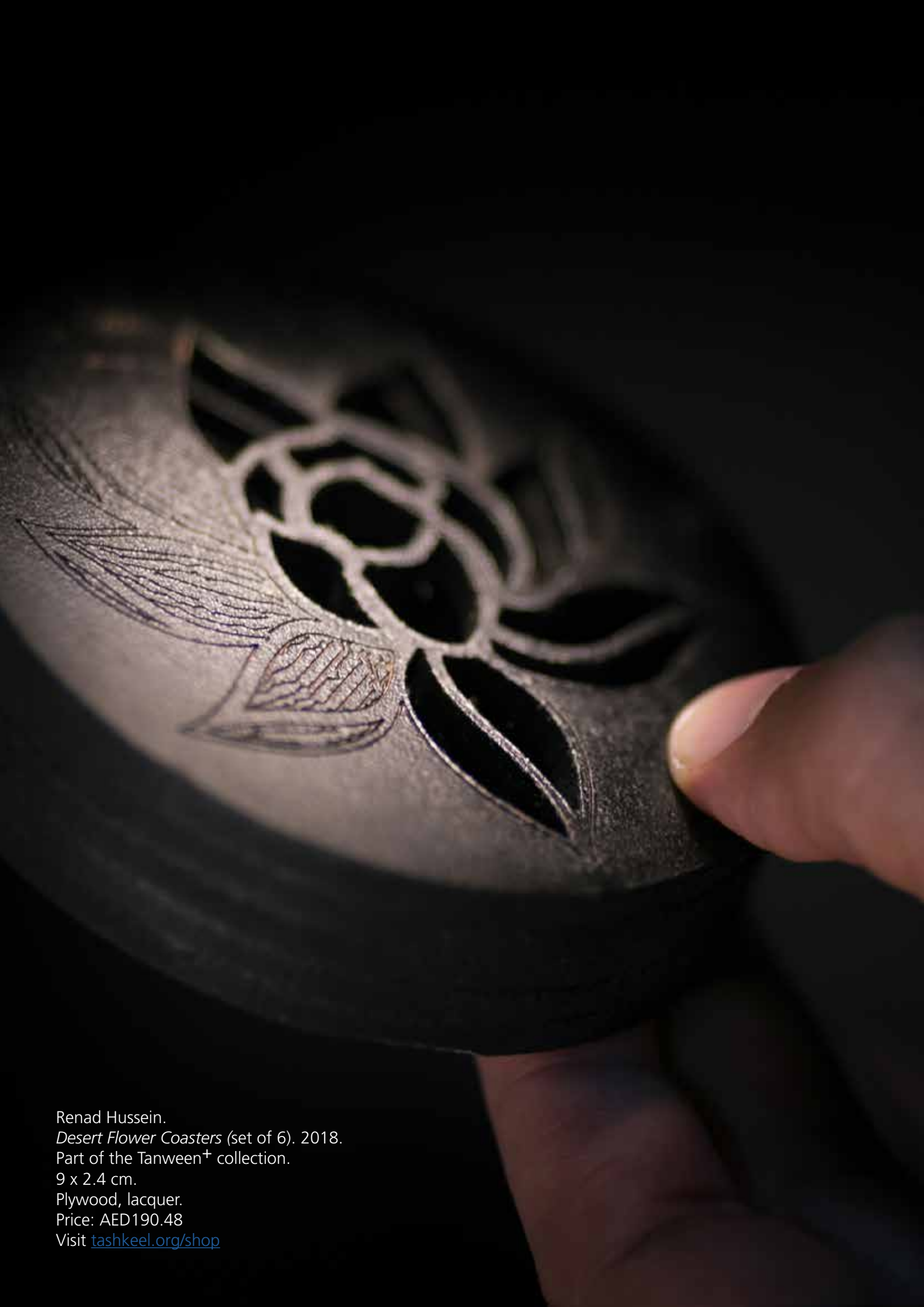
Renad Hussein. Desert Flower Coasters (set of 6). 2018. Part of the Tanween + collection. 9 x 2.4 cm. Plywood, lacquer. Price: AED190.48 Visit tashkeel.org/shop