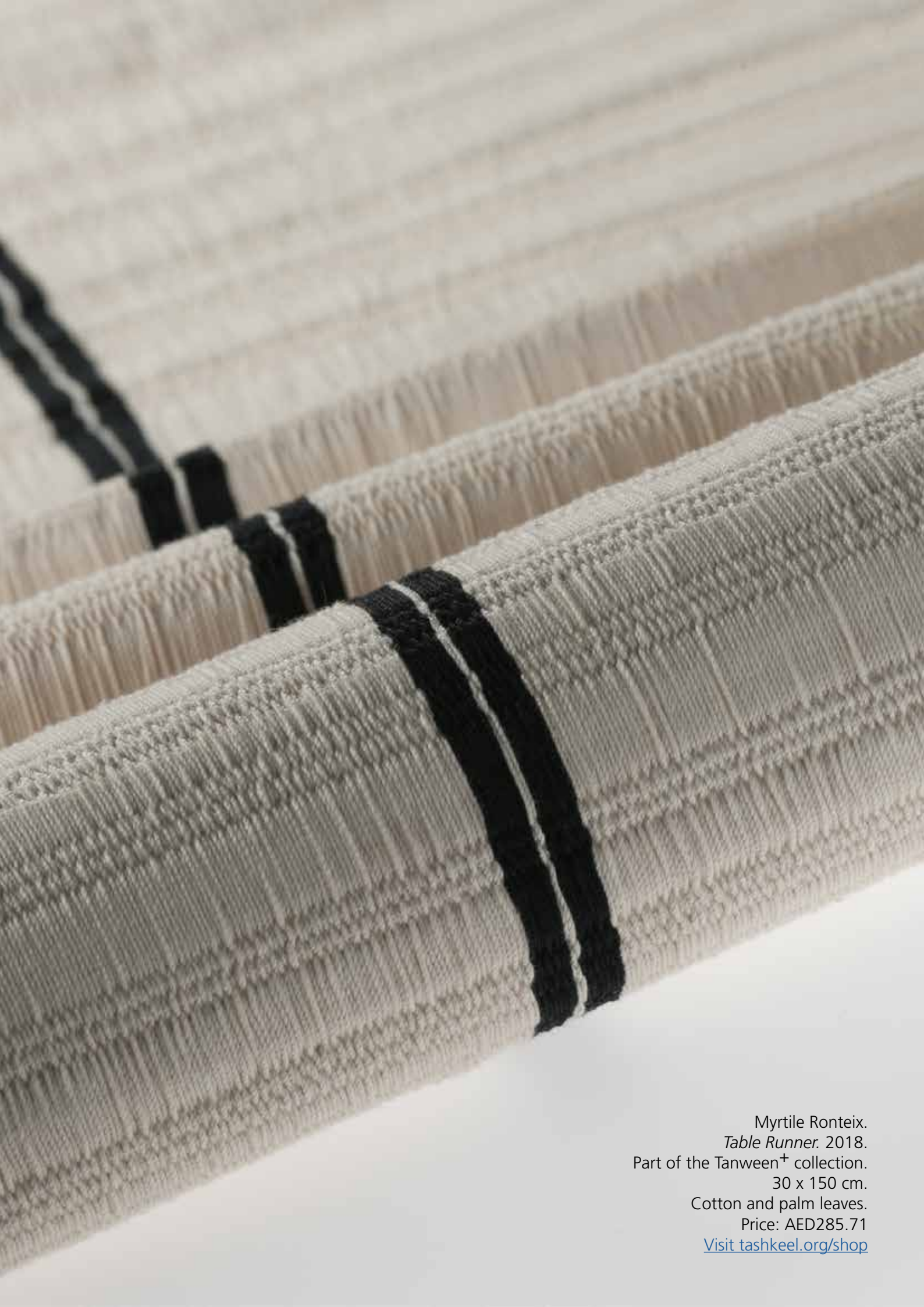
Myrtille Ronteix. Table Runner . 2018. Part of the Tanween + collection. 30 x 150 cm. Cotton and palm leaves. Price: AED285.71 Visit tashkeel.org/shop