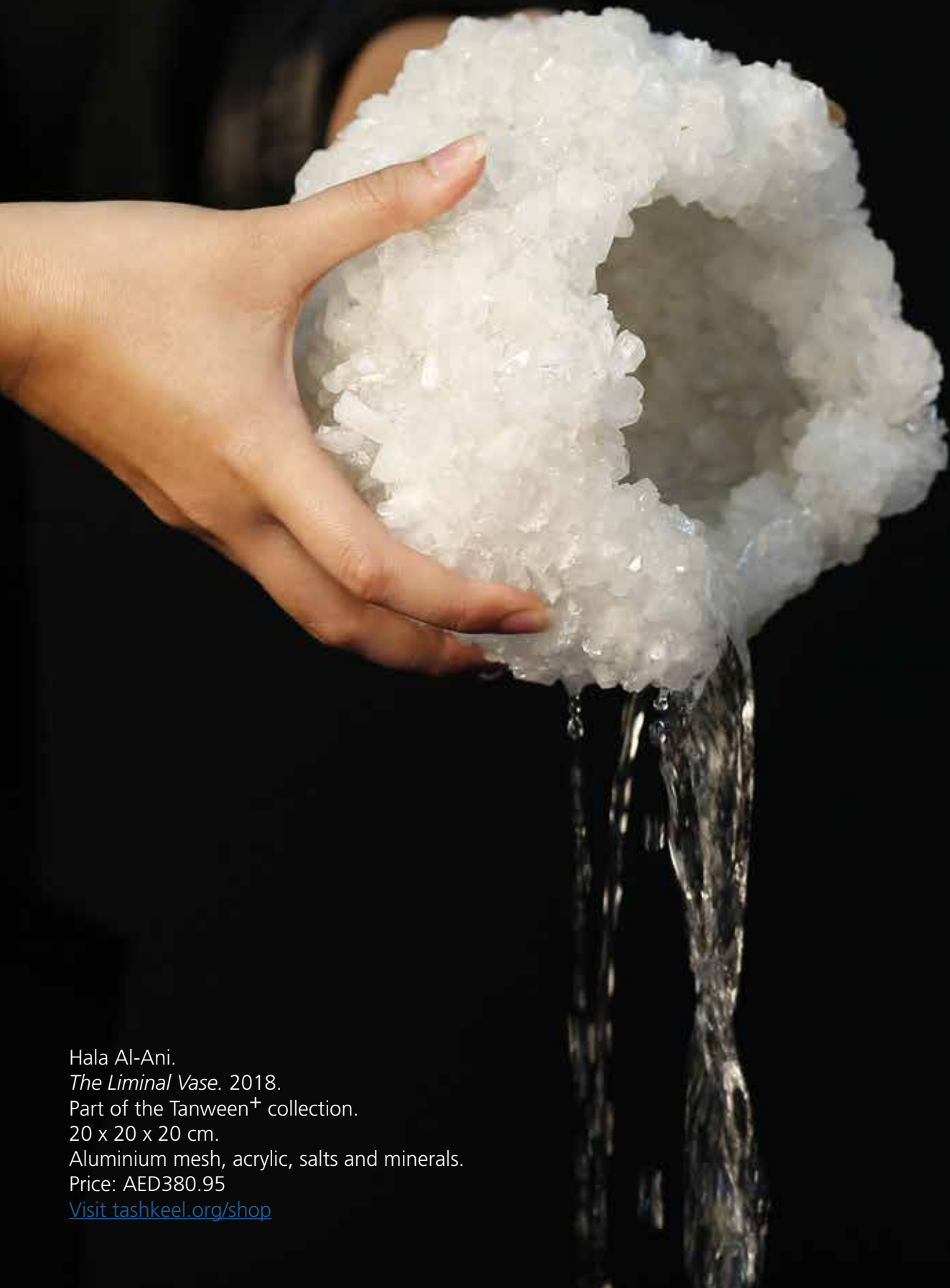
Hala Al-Ani. The Liminal Vase . 2018. Part of the Tanween + collection. 20 x 20 x 20 cm. Aluminium mesh, acrylic, salts and minerals. Price: AED380.95 Visit tashkeel.org/shop