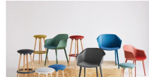
Empowerment Through Diversity and Community Engagement at Via Seating