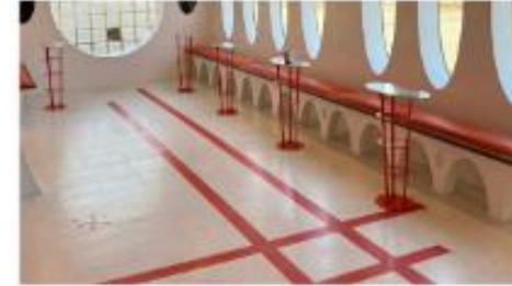
VCT, Reimagined: From Utility to Creative Canvas