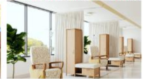
Crafting Conversations for Wellness: The Power of Poetic Healthcare Furniture Design