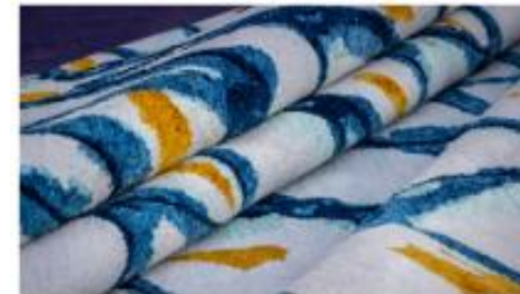
The Next Frontier: Nature-Inspired Circular Materials