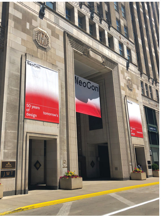
Pictured: The Mart 1957; The Mart 2018.