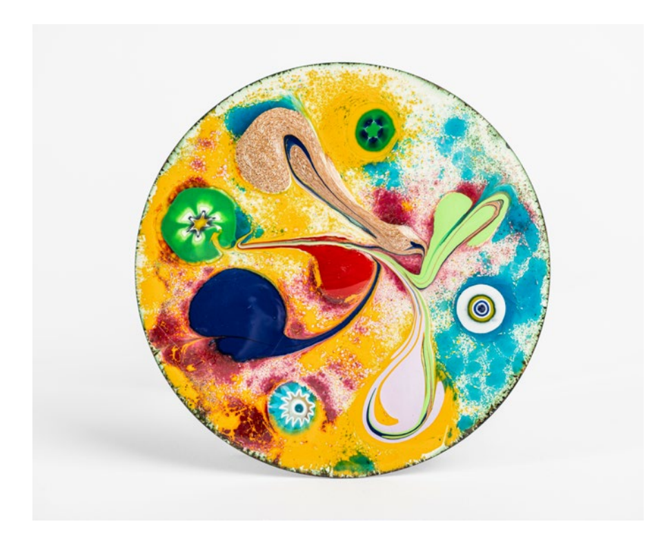
Enamel Round Date Unknown Metal circular disc

This effect is created using fine particles of glass applied to metal by dry sifting the particles onto the surface or by wet packing them into channels or depressions in the metal. Once applied, the enamels are heated, using a kiln or torch, until they soften and flow.