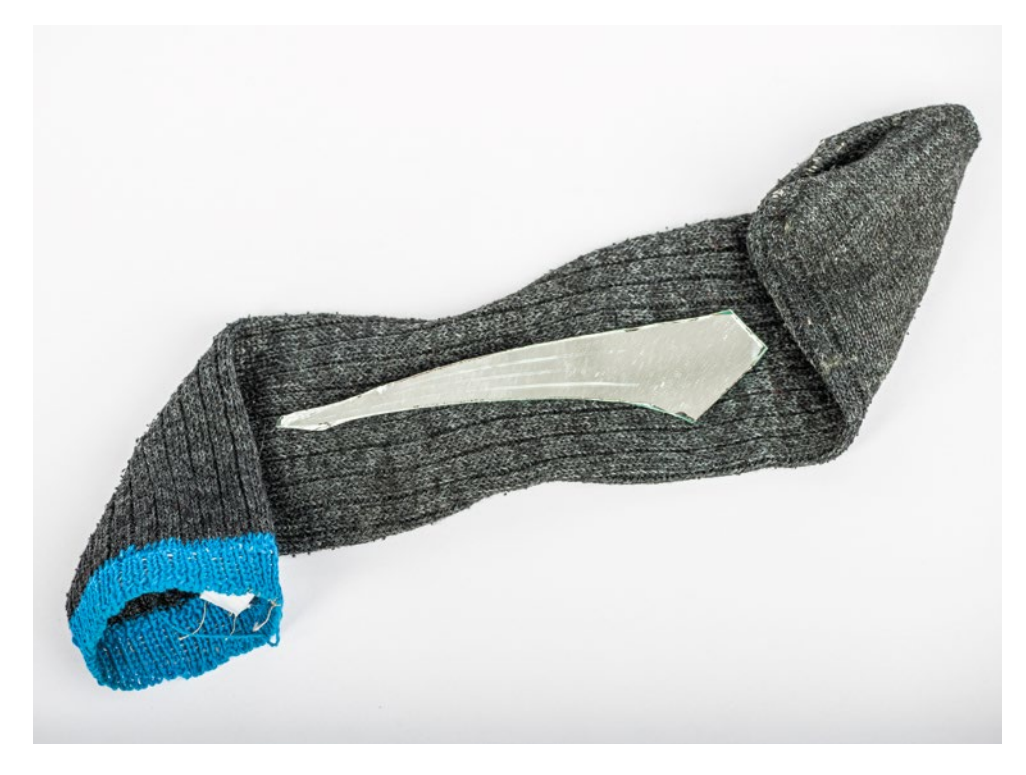
Sock and mirror

Date Unknown Woollen sock Piece of mirror