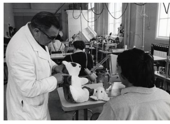
HMP Standford Hill

He is very heavily padded, so we named him 'Mr Heavy Wadding'. We were also curious to see whether there was something more than just his wadding inside him. We had him x-rayed at the Conservation Department at the University of Lincoln. Look at his x-ray below and see if you can see an indistinctive shape in his chest!