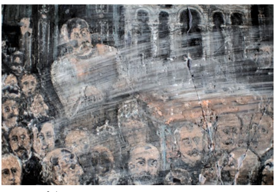
Reverse of slate

This drawing is of the alter scene in the chapel at HMP Parkhurst, depicting scenes such as the last supper and Christ's crucifixion. Whether this drawing was done of the alter scene or was a preparatory sketch for the alter we don't know. On the back of the slate is another drawing that has been rubbed to blur the faces in the illustration.