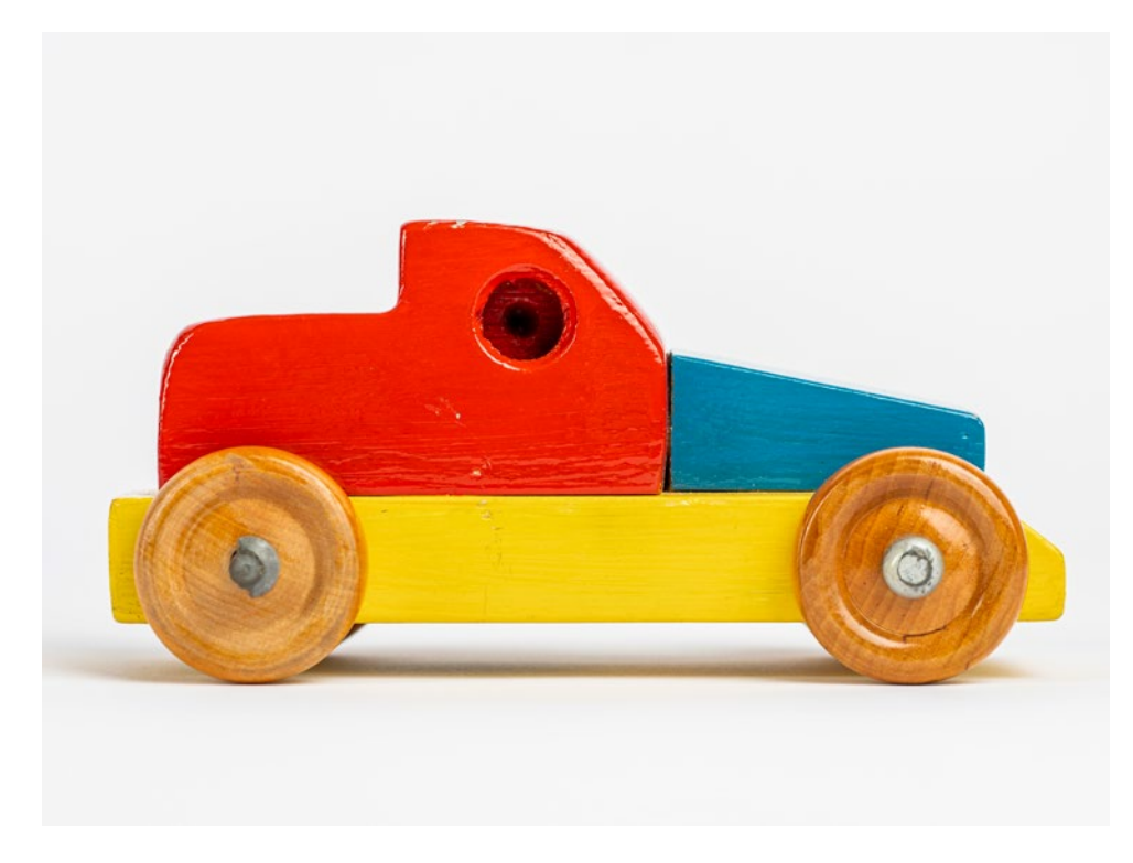
Toy Car Date Unknown Wood Metal fixings

Wooden toy car made in a NACRO workshop at HMP Wandsworth and sold through a prison charity shop. On the underside of the car is a price ticket for £7.00.