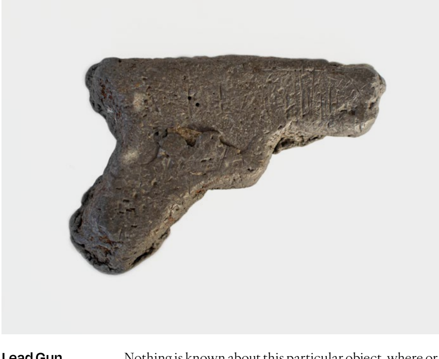
Lead Gun Date Uknown Lead