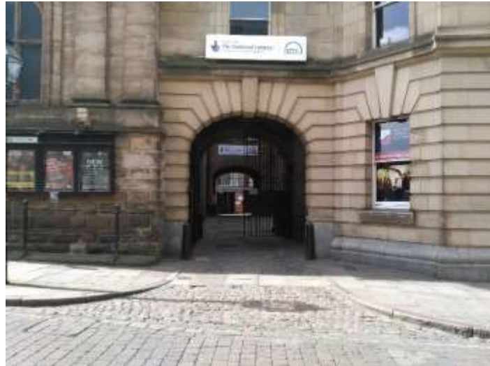
View from High Pavement showing tunnel entry to lift facility