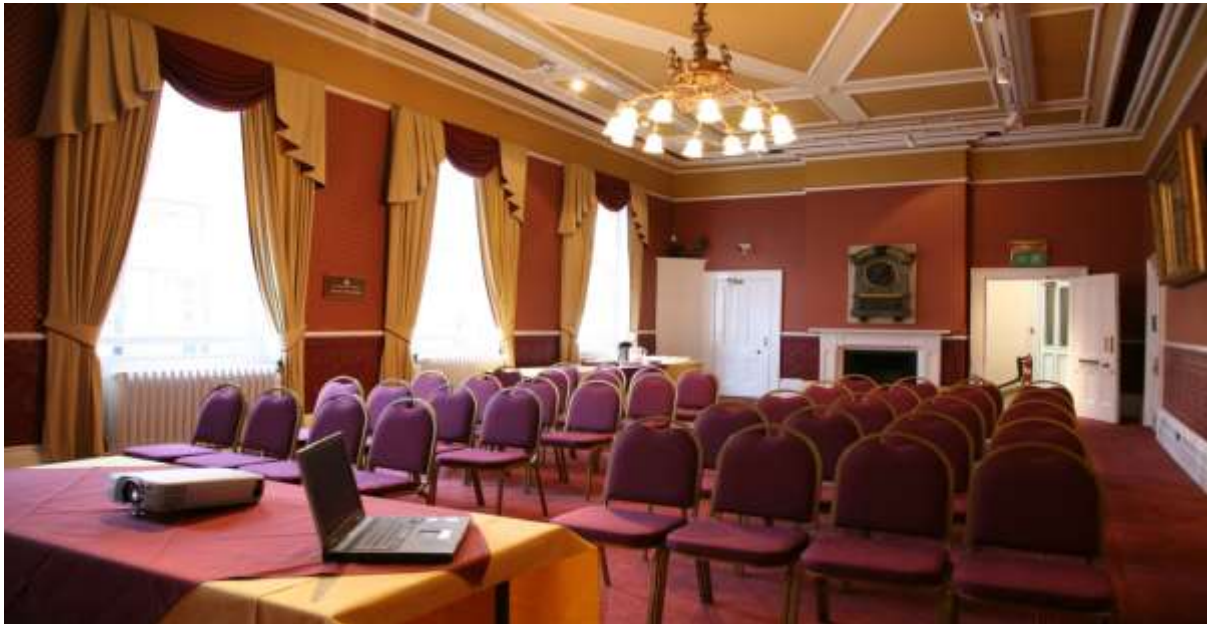
Grand Jury Room