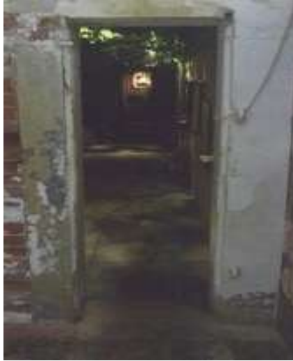
Convict ship exhibition