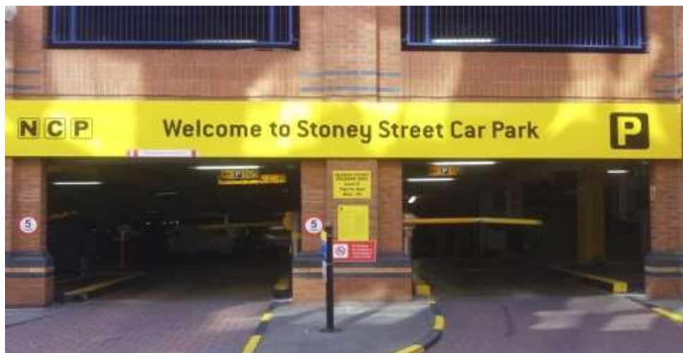
Entry to Stoney Street car park