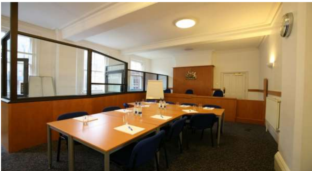
Youth Court meeting room