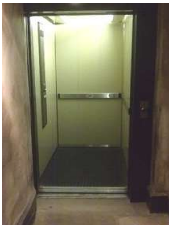
Court room lift