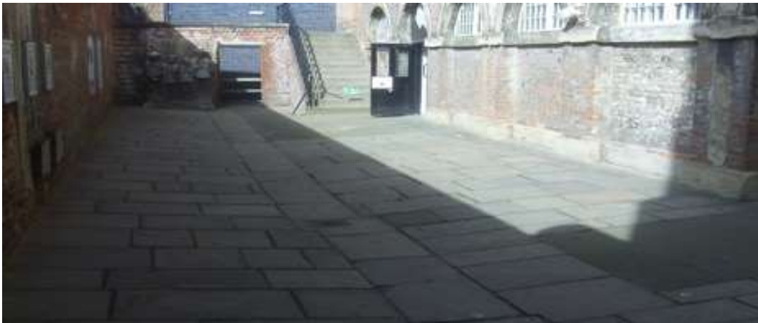
Main exercise yard at lower basement level