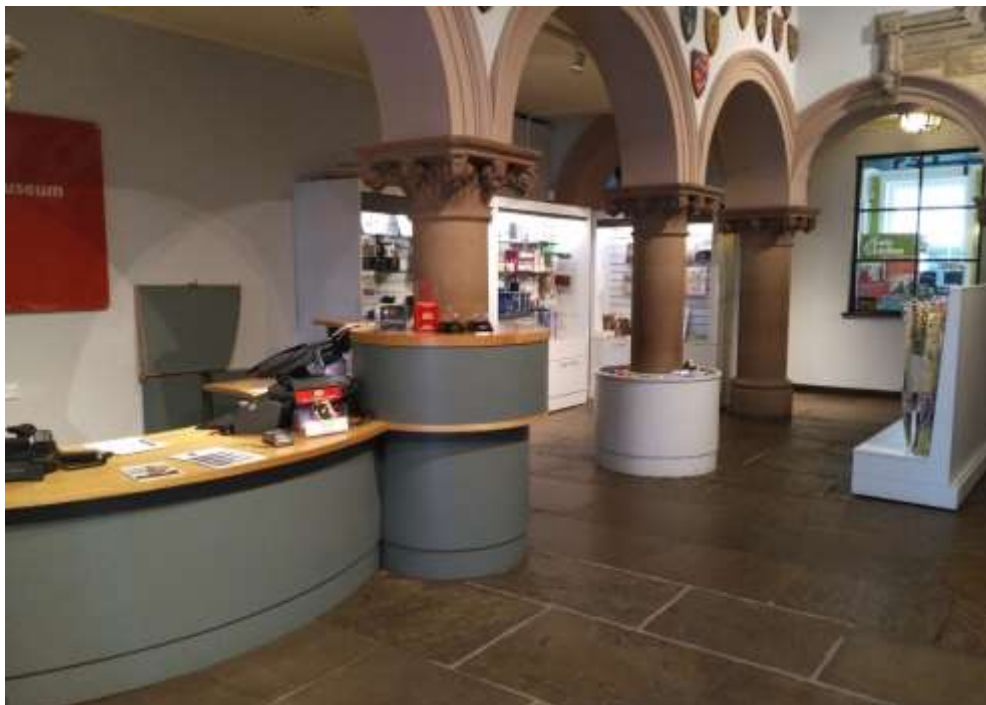
Main reception desk with shop area