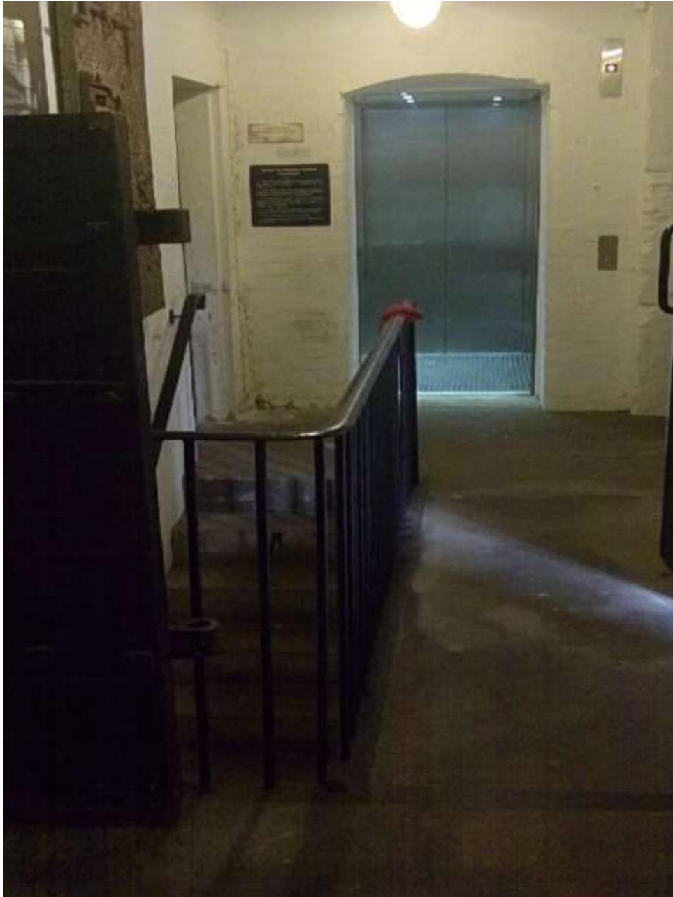
Main lift at 1833 wing (basement level)