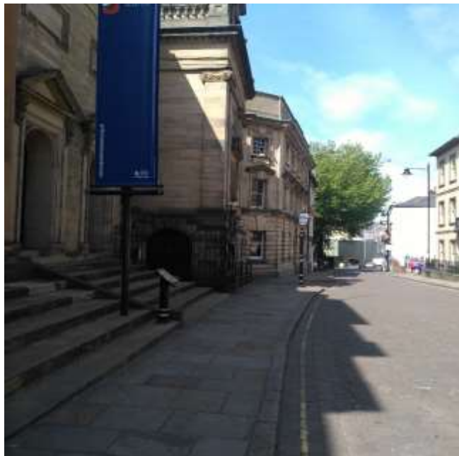
High Pavement approach road showing gradient and Nottingham Contemporary gallery. (Gold and green building)