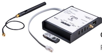
Garrett iC Module v2 PN 1174300