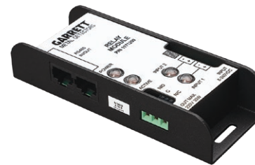
I/O Relay Module PN 1171200