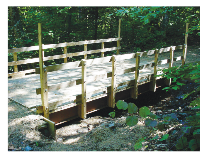
Figure 14-Low-use trail railing system with beveled posts to shed water.