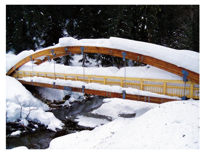
Figure 10-Trail bridges should be designed for snow loads.

loads in the West. Site-specific snow load information is also available on the Applied Technology Council (ATC) website <https://hazards.atcouncil. org/>. The NTDP "National Snow Load Information" website <http://www.fs.fed.us/eng/snow_load/> provides further information about snow loads.