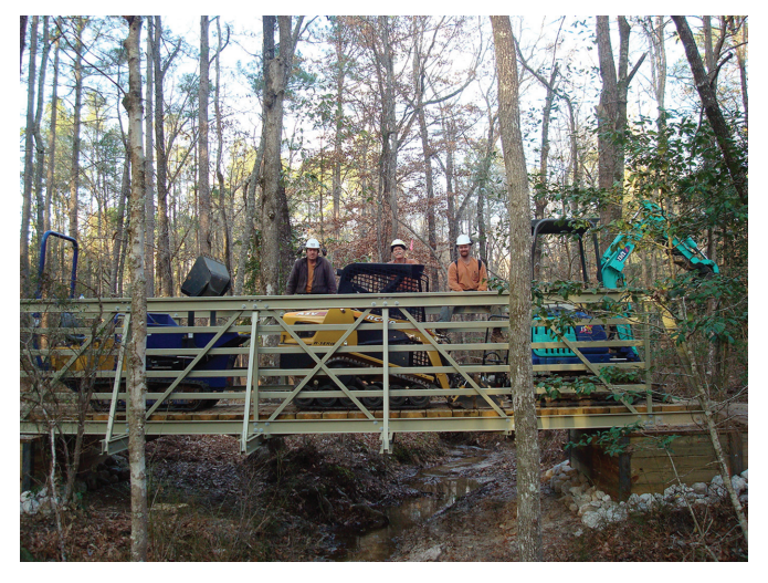
Figure 11—Trail bridges should be designed to support applicable trail maintenance equipment.

pounds). The design should specify weight limit signs for bridges 7 feet and wider using R12-1 signs in conformance with the Federal Highway Administration "Manual for Uniform Traffic Control Devices" (MUTCD). The bridge design engineer can provide the appropriate weight limits for the signs.