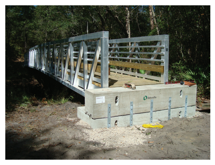
Figure 17-Rub rails installed on an aluminum side truss bridge to protect the railing system.

Installing rub rails at the height of the center of wheels of the design vehicle can provide protection for the railing system and superstructure trusses from impact from tires (figure 17).