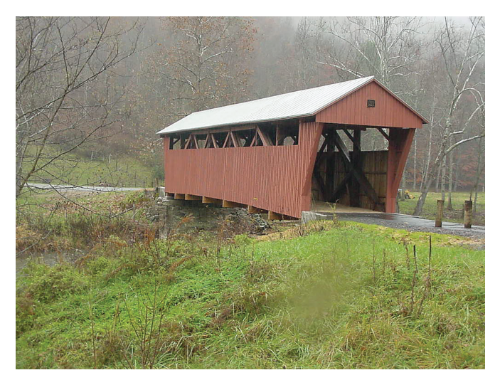
Figure 8—Many old covered bridges are being converted into pedestrian bridges.

Traditional covered bridges were essentially side truss bridges (figure 8). Most modern covered bridges use conventional side girders or deck girders. The covering is simply added to the top of the bridge to protect the structure from weather and deterioration. Covered bridges span from 10 to 300 feet (table 6).