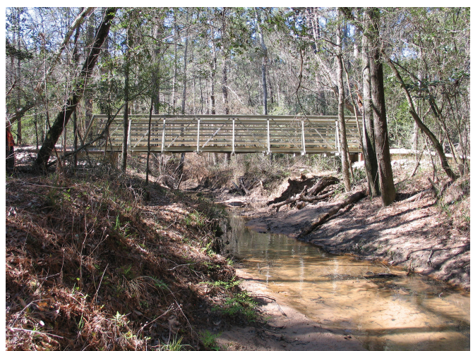
Figure 5-A fiber-reinforced polymer bridge where the truss is also part of the handrail system.

Side girder and side truss bridges generally consist of two longitudinal girders or trusses with floor beams or ledger beams attached to the inside of the main girders or trusses. Ledgers support transverse deck planks, and floor beams support longitudinal deck planks. On larger bridges, floor beams may support the stringers. The girders or trusses usually function as all, or part of, the handrail system (figure 5). Decks are usually timber (sawn plank or glulam), but may be concrete, steel, or FRP. Side girder and side truss bridges typically span from 40 to 240 feet (table 3).