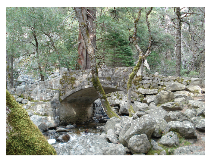
Figure 6—This masonry arch trail bridge was originally constructed for vehicle traffic.