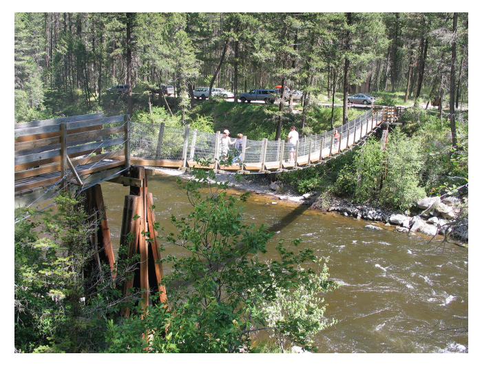
Figure 7—A deck cable bridge supported by two main cables on timber towers.

Two main steel cables support simple suspension bridges (figure 7). The two main cables directly support the deck, so the deck follows an arc down and up from each abutment along the sag of the cables. The abutments anchor the cables, and intermediate towers may or may not support the cables. Decks are usually sawn timber planks. Two cables above the deck serve as handrails.