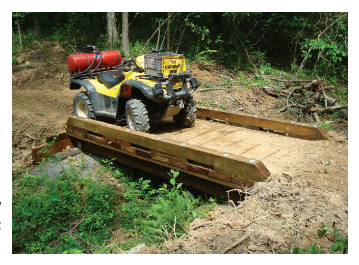
Figure 9—A single-unit timber bridge designed to accommodate all-terrain vehicles, bicycles, and hikers.

Equestrian loads require bridge design engineers to design bridge decks for a patch load of 1,000 pounds over a square area measuring 4 inches on each side. Equestrian loads usually require thicker decking than pedestrian loads. Typical decking material for equestrian loads is 3 by 8 (or larger) planks. Bridge design engineers must design the entire trail bridge, including the deck, for the required uniform pedestrian or equestrian load in combination with other loads.