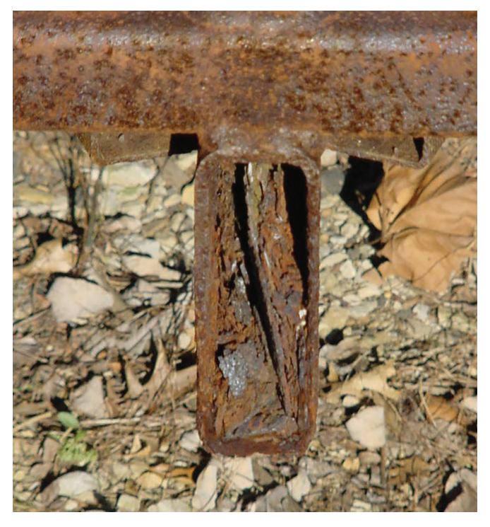
Figure 16-A weathering steel floor beam with corrosion issues in a humid climate.

Refer to the U.S. Department of Transportation, Federal Highway Administration, "Technical Advisory T5140.22—Uncoated Weathering Steel in Structures" website <http://www.fhwa.dot.gov/bridge/t514022. cfm> for further information.