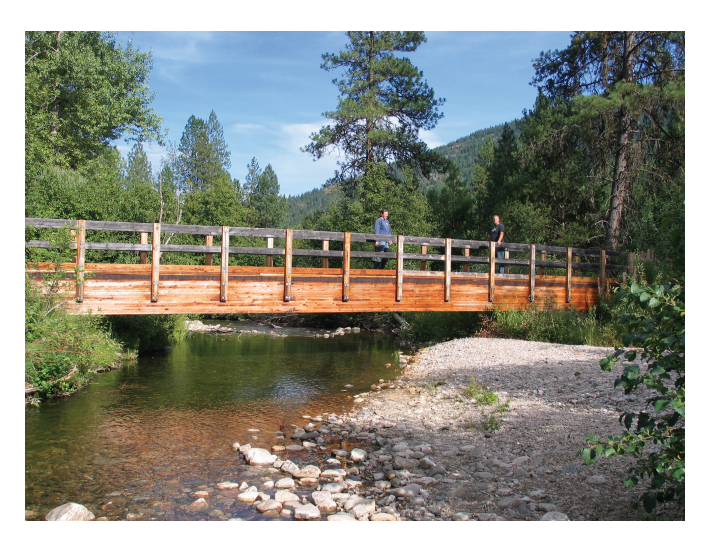
Figure 3-A glued-laminated (glulam) deck girder trail bridge.

Deck girder and deck truss bridges generally consist of two or more longitudinal stringers or trusses that support the top-mounted deck (figure 3). Deck girder and deck truss bridges span from 10 to 120 feet (table 1). Their decks are usually made of timber (log, sawn, or glued-laminated [glulam]), but may be fiberreinforced polymer (FRP), concrete, or steel. Bridge design engineers recommend a minimum of three stringers or trusses for structural redundancy of the bridge.