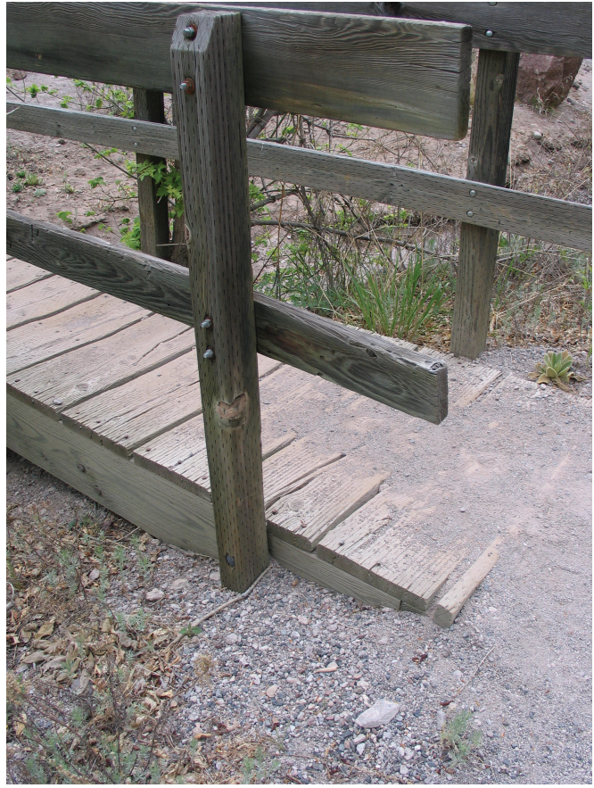
Figure 15-Backwalls should be extended to prevent the soil from contacting the beams.

Installing backwalls at the ends of the bridge stringers provides another practical design detail to help keep the stringers and sills clean and free of dirt (figure 15). The backwall planks should extend beyond the sides of the bridge to help keep dirt from wrapping around the backwall and accumulating on the sills next to the stringers. Backwalls help to prevent the approach fill adjacent to the bridge from eroding. Backwalls also help to reduce moisture from wicking into the end grain of the stringers. Constructing a small air gap using ½-inch-thick by 2-inch-wide boards between the ends of the stringers and backwall will allow air to flow around the ends of the stringers and will reduce moisture from being trapped.