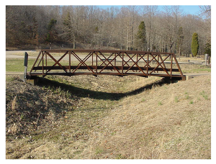
Figure 13—Prefabricated steel bridges are included in the standard trail bridge plans and specifications.