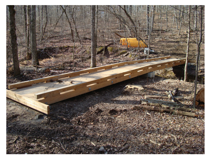
Figure 4-A single-unit bridge with two timber slabs.