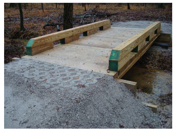
Figure 1 – A 15-foot span timber bridge classified as a minor trail bridge, which was constructed using Forest Service standard trail bridge plans.

This report focuses on the design of new bridges that the Forest Service classifies as minor and major trail bridges (figure 1) (Forest Service Manual [FSM] 7737.05). These bridges are short, single-span trail bridges constructed of wood. National Environmental Policy Act (NEPA) requirements, landownership issues, and Federal and State permitting requirements are beyond the scope of this report.