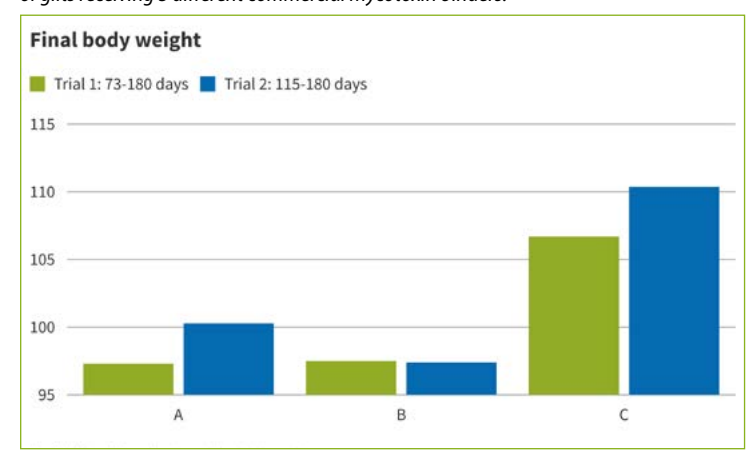
Figure 1 – Body weight (BW), average daily gain (ADG) and feed conversion ratio (FCR) of ailts receiving 3 different commercial mycotoxin binders.