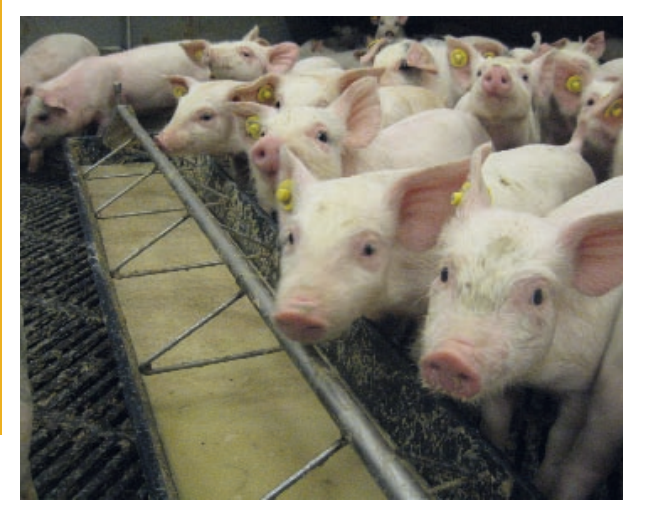
Piglets need about three weeks after weaning to develop their intestinal microflora.