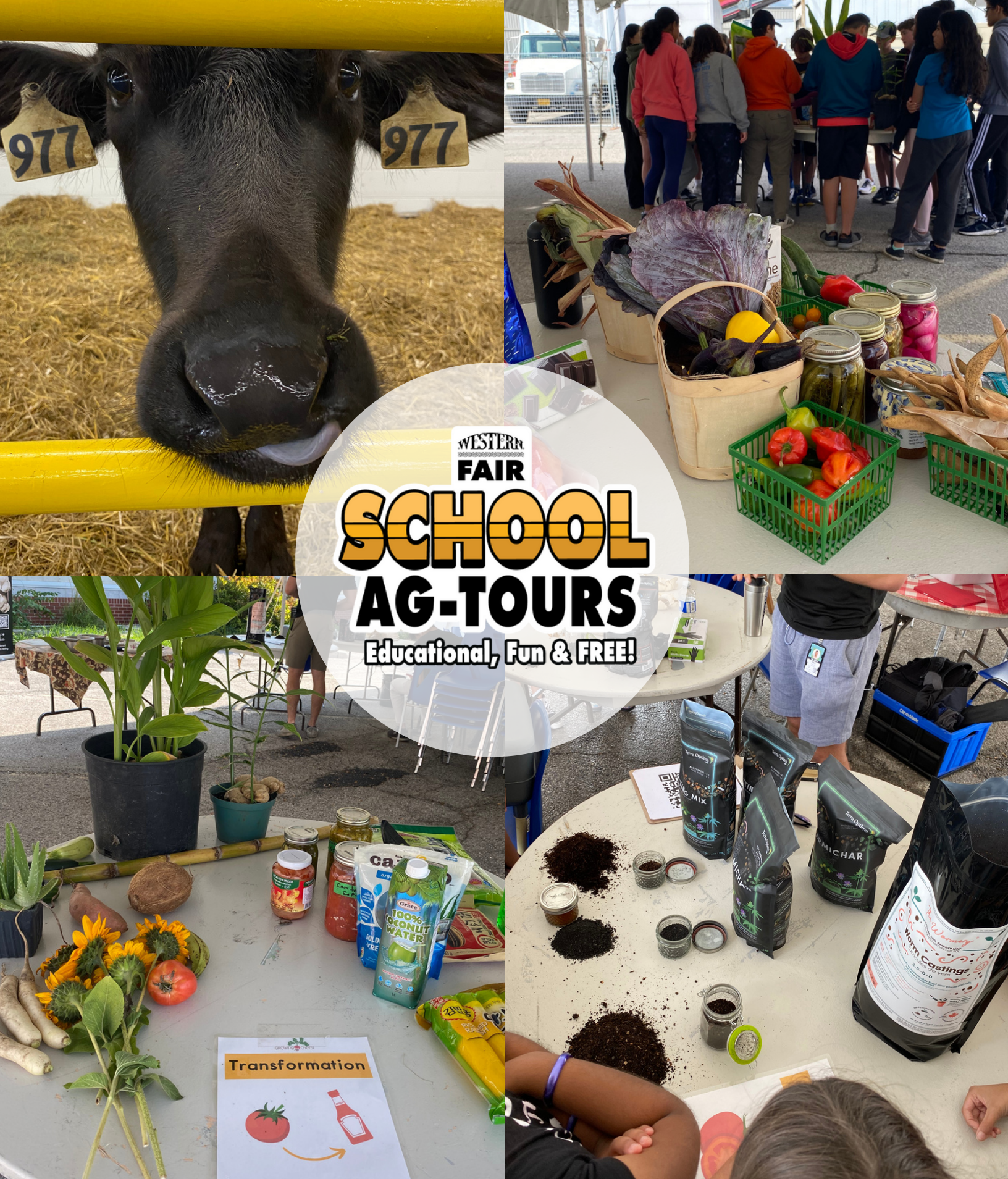
In September, we partnered with the Grove at Western Fair District, along with Ontario Pork and Dairy, Beef, Grain and Egg Farmers of Ontario to lead 1500 students through a week of hands-on field trips exploring the entire food system!