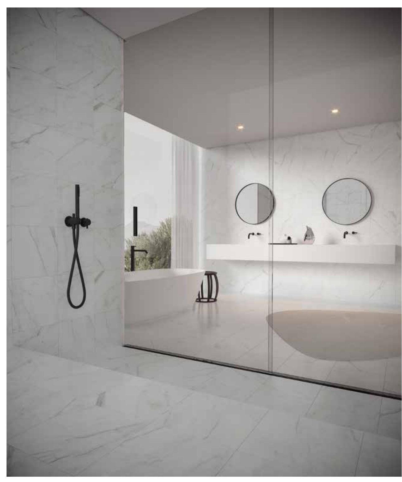
13 x 13 in / 33 x 33 cm Altezza Carrara Matte Pressed Glazed Porcelain Tile