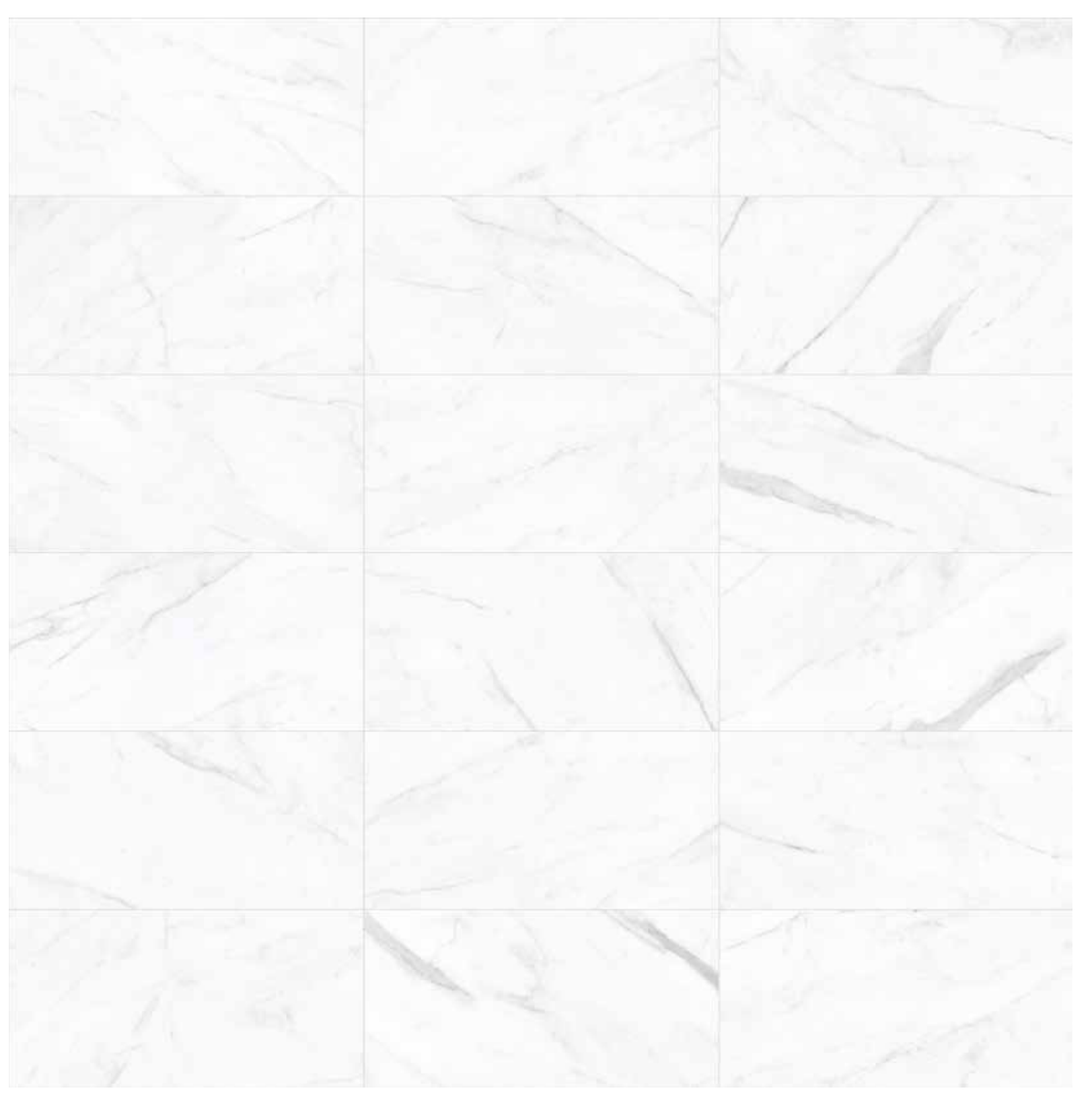
12 x 24 in / 30 x 60 cm image variations

12 x 24 in | 30 x 60 cm Actual: 300 x 600 x 8.5 mm 32 images