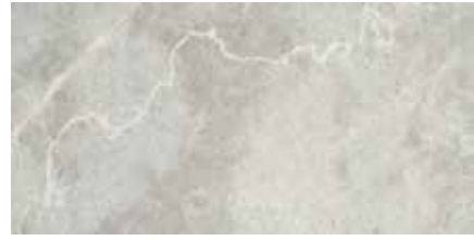
12 x 24 in / 30.5 x 61 cm Honed 5000-0666-0