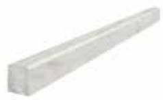
1/2 x 12 in / 1.3 x 30.5 cm Deco-Bar Honed 5002-0131-0