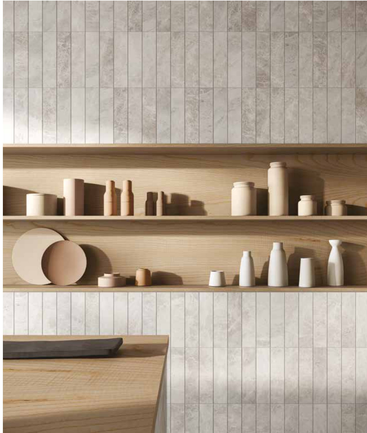
3 x 12 in / 7.5 x 30.5 cm Apollo Argento Honed Marble Tile On the floor: 12 x 24 in / 30.5 x 61 cm Apollo Argento Honed Marble Tile