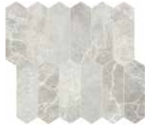
2 x 6 in / 4.9 x 15 cm Picket Mosaic Honed 5001-0373-0