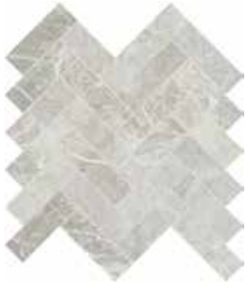
1.25 x 4 in / 3.3 x 10 cm Herringbone Mosaic Honed 5001-0372-0