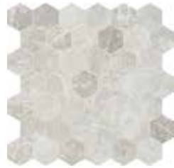
2 in / 4.9 cm Hexagon Mosaic Honed 5001-0371-0