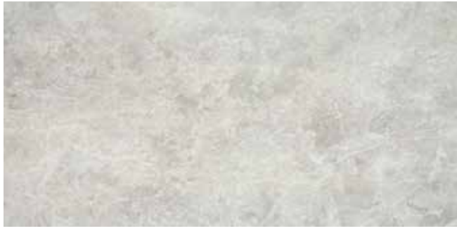
18 x 36 in / 45.7 x 91.4 cm Honed 5000-0667-0