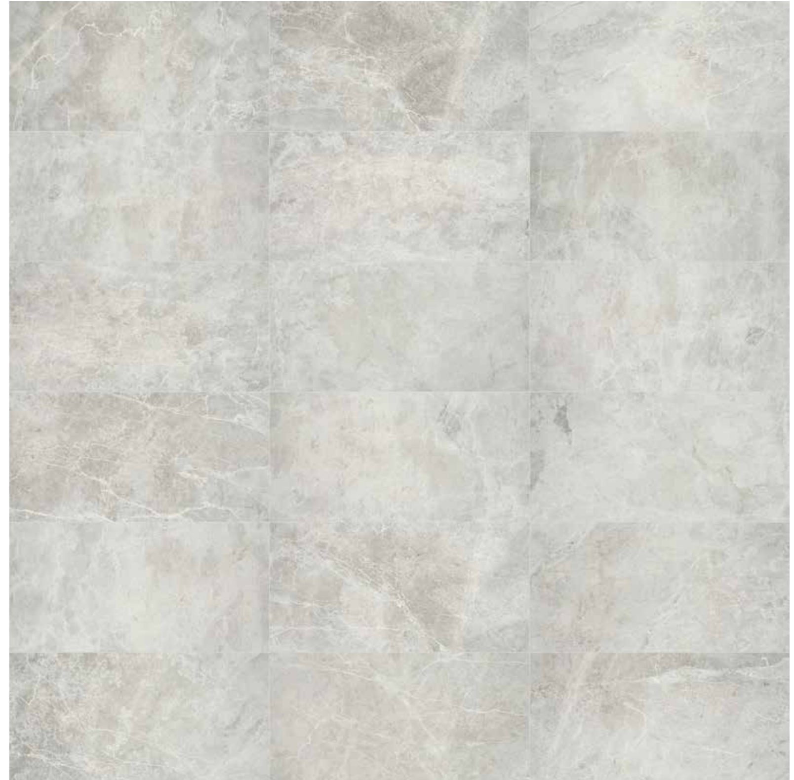
18 x 36 in / 45.7 x 91.4 cm tile variations

The inherent beauty of natural stone products is expressed through variations in color, texture, shading and veining.