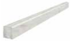
1/2 x 12 in / 1.3 x 30.5 cm Deco-Bar Honed 5002-0131-0