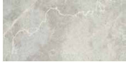
12 x 24 in / 30.5 x 61 cm Honed 5000-0666-0