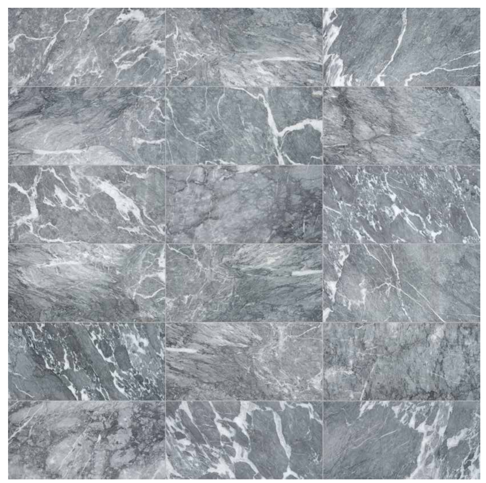
18 x 36 in / 45.7 x 91.4 cm tile variations

The inherent beauty of natural stone products is expressed through variations in color, texture, shading and veining.