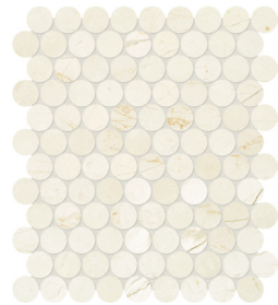
1.25 in / 3 cm Penny Round Mosaic Honed 5001-0261-0