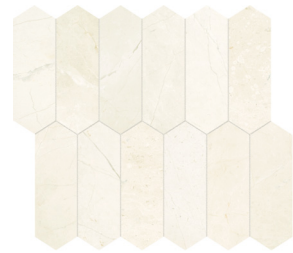
2 x 6 in / 4.9 x 15 cm Picket Mosaic Honed 5001-0259-0