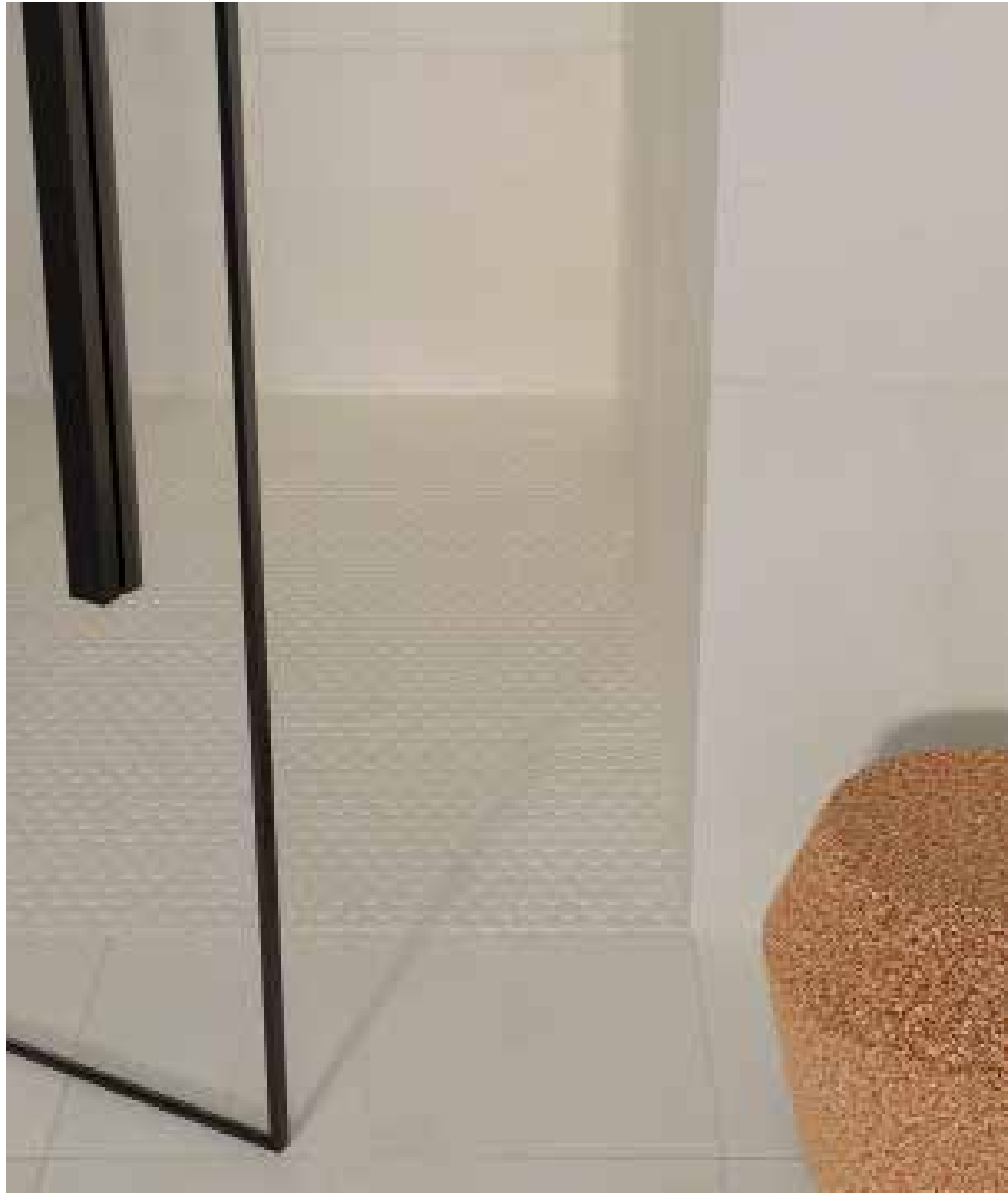
1.25 in / 3 cm Avorio Crema Penny Round Honed Marble Mosaic