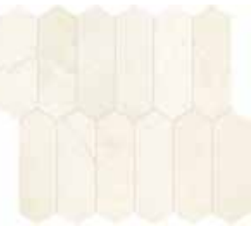
2 x 6 in / 4.9 x 15 cm Picket Mosaic Honed 5001-0259-0