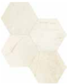
6 in / 15 cm Hexagon Mosaic Honed 5001-0260-0