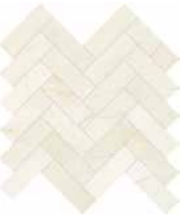
1.25 x 4 in / 3.3 x 10 cm Herringbone Mosaic Honed 5001-0258-0