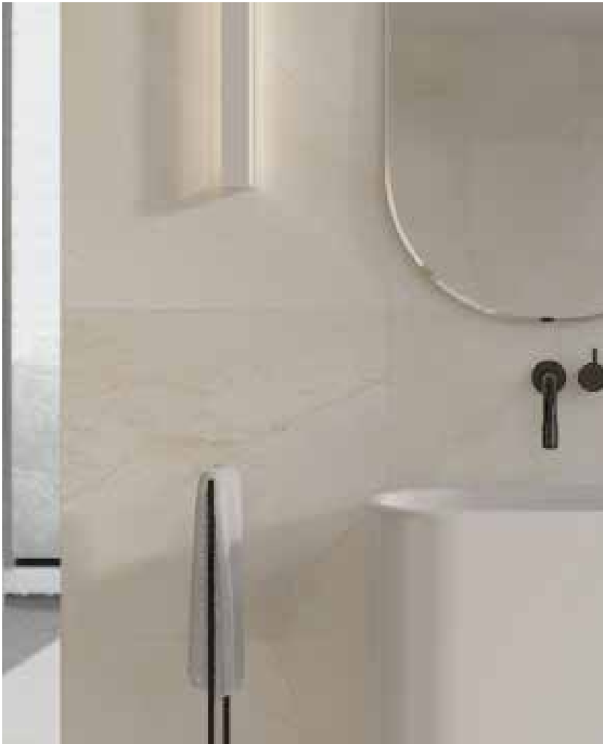
24 x 24 in / 61 x 61 cm Avorio Crema Honed Marble Tile