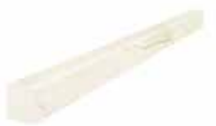
1/2 x 12 in / 1.3 x 30.5 cm Deco-Bar Honed 5002-0132-0

The inherent beauty of natural stone products is expressed through variations in color, texture, shading and veining.