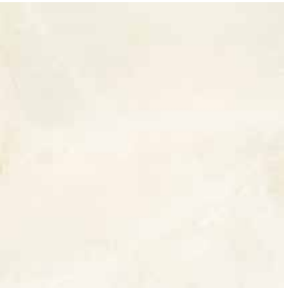
24 x 24 in / 61 x 61 cm Honed 5000-0371-0