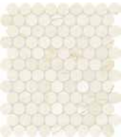
1.25 in / 3 cm Penny Round Mosaic Honed 5001-0261-0