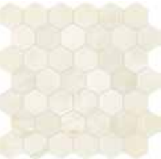
2 in / 4.9 cm Hexagon Mosaic Honed 5001-0257-0