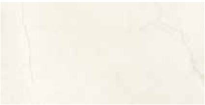
12 x 24 in / 30.5 x 61 cm Honed 5000-0372-0