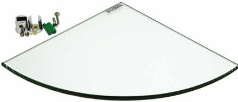
9 in / 23 cm Glass Corner Shelf Surface Mount 2000-0033-0