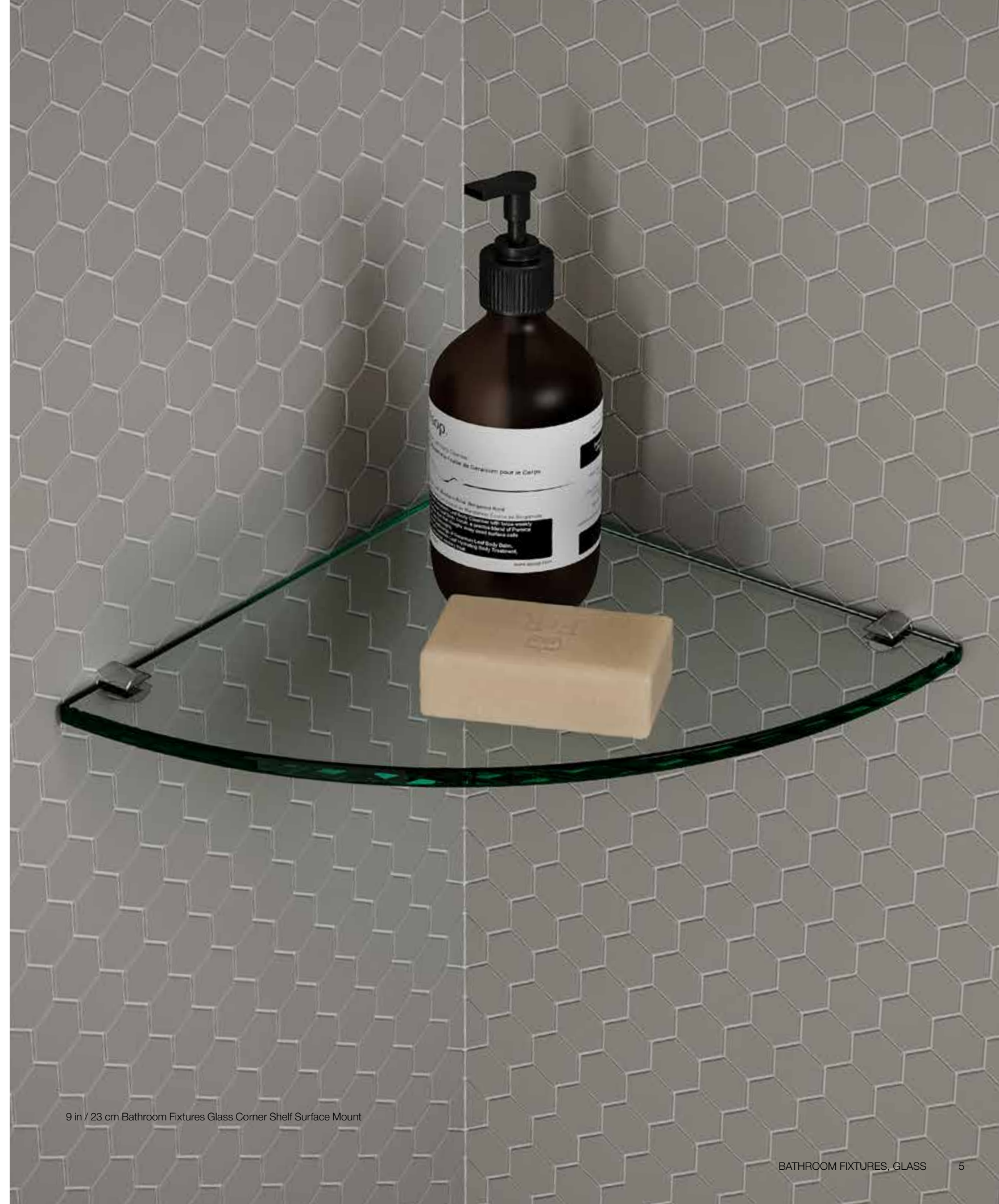
9 in / 23 cm Bathroom Fixtures Glass Corner Shelf Surface Mount