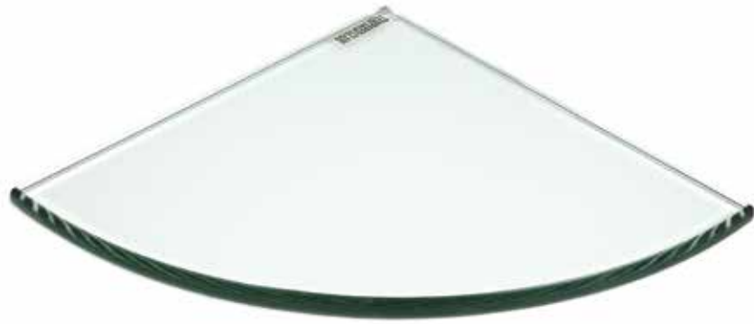
9 in / 23 cm Glass Corner Shelf Recessed Mount 2000-0032-0