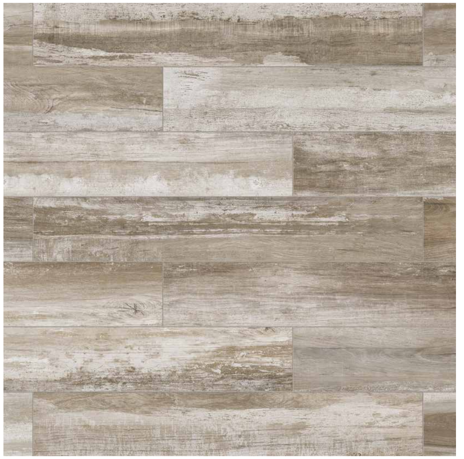
6 x 36 in / 15 x 90 cm image variations

8 x 48 in | 20 x 120 cm Actual: 200 x 1200 x 10.7 mm 44 images