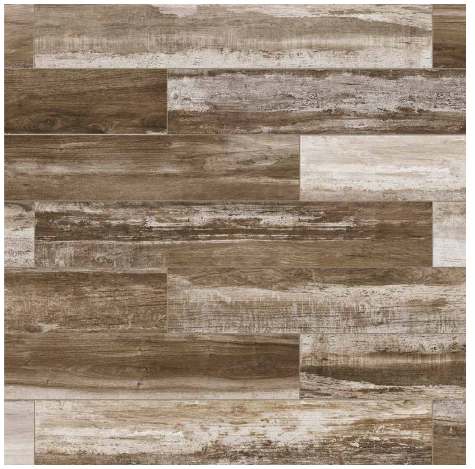
6 x 36 in / 15 x 90 cm image variations

8 x 48 in | 20 x 120 cm Actual: 200 x 1200 x 10.7 mm 44 images