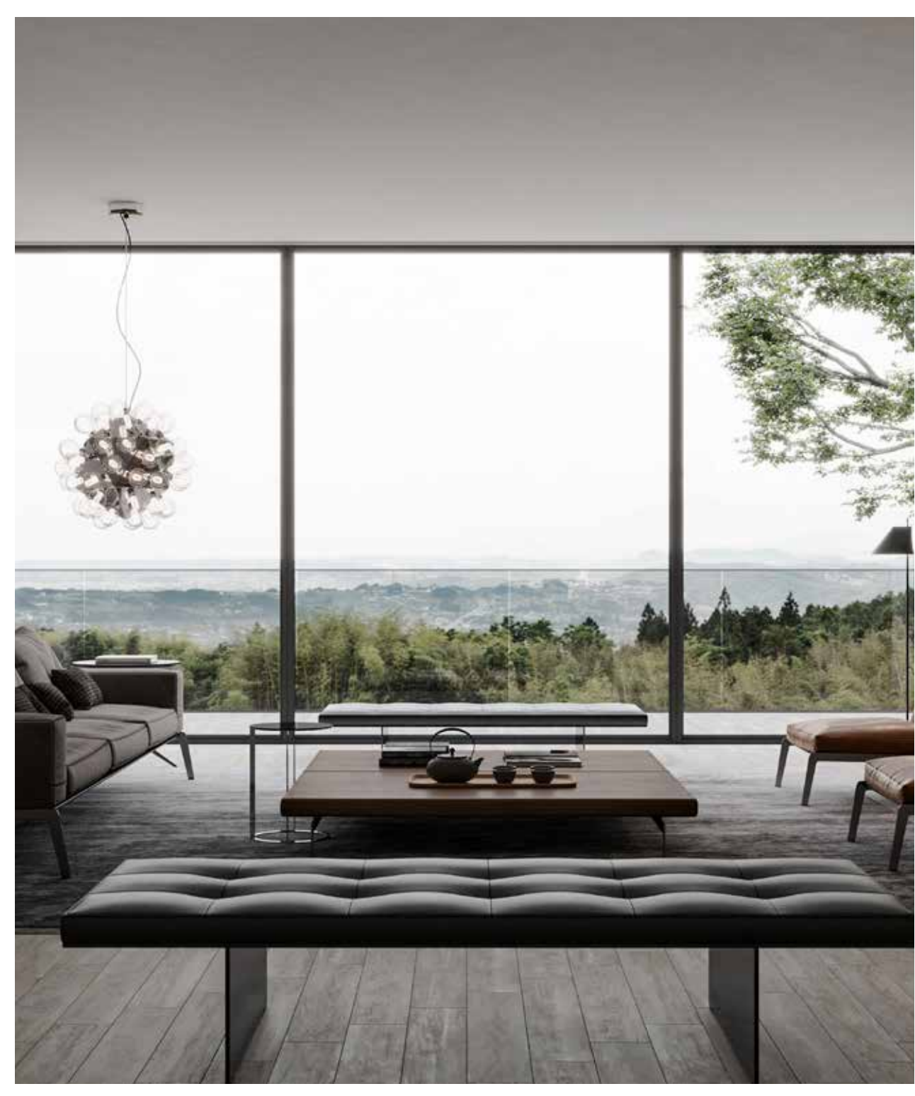
6 x 36 in / 15 x 90 cm Cabin Cypress Matte Rectified Glazed Porcelain Tile