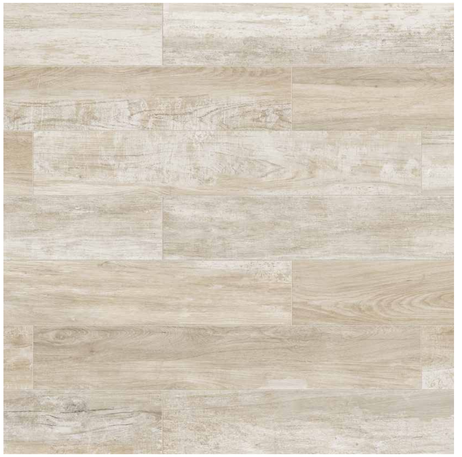
6 x 36 in / 15 x 90 cm image variations

8 x 48 in | 20 x 120 cm Actual: 200 x 1200 x 10.7 mm 44 images