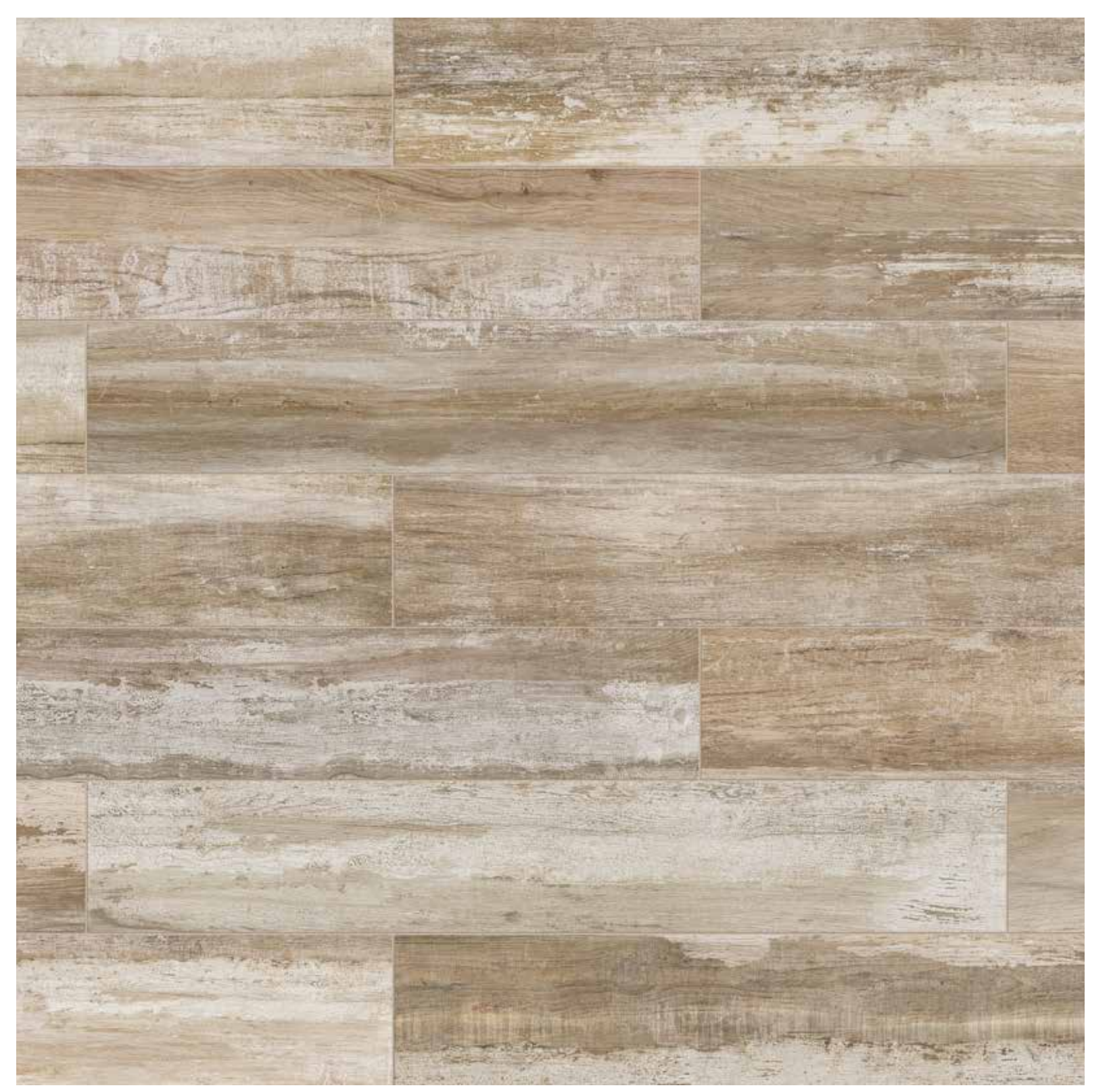
6 x 36 in / 15 x 90 cm image variations

8 x 48 in | 20 x 120 cm Actual: 200 x 1200 x 10.7 mm 44 images