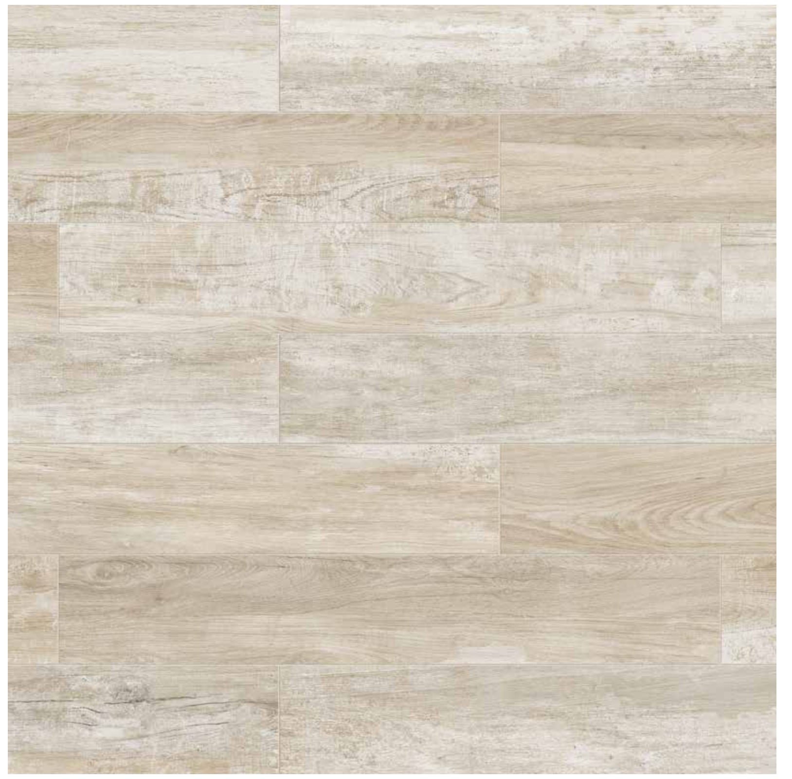
6 x 36 in / 15 x 90 cm image variations

8 x 48 in | 20 x 120 cm Actual: 200 x 1200 x 10.7 mm 44 images