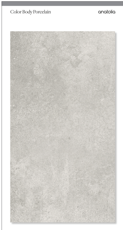
Backer Board Size: 3.25 x 6 in / 8.25 x 15.25 cm

Anatolia has created a sample chip program that categorizes sample chips into color coded material types, includes a sample chip affixed to an elegant backer card and includes all of the key technical information and formats for that color on its back label. Anatolia also developed a premium sample chip carrying case to easily and beautifully store, organize, and carry sample chips to meetings.