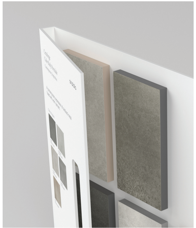
A&D Board Inside