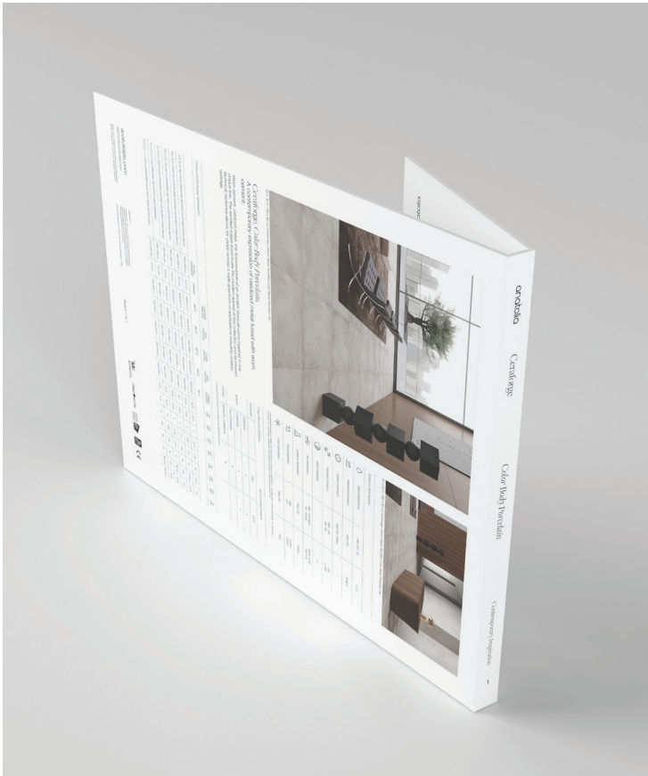
A&D Board Outside

This unique to Anatolia A&D board sits on shelf folded with a book like spine that clearly identifies the collection name, material type and corresponding inspiration for the collection. When pulled out slightly, one can easily see the collection's colors at a glance.