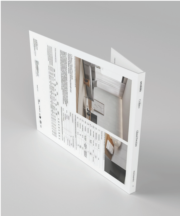
A&D Board Outside

This unique to Anatolia A&D board sits on shelf folded with a book like spine that clearly identifies the collection name, material type and corresponding inspiration for the collection. When pulled out slightly, one can easily see the collection's colors at a glance.