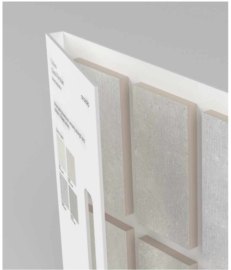
A&D Board Inside