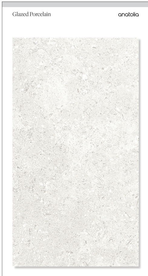
Backer Board Size: 3.25 x 6 in / 8.25 x 15.25 cm

Anatolia has created a sample chip program that categorizes sample chips into color coded material types, includes a sample chip affixed to an elegant backer card and includes all of the key technical information and formats for that color on its back label. Anatolia also developed a premium sample chip carrying case to easily and beautifully store, organize, and carry sample chips to meetings.