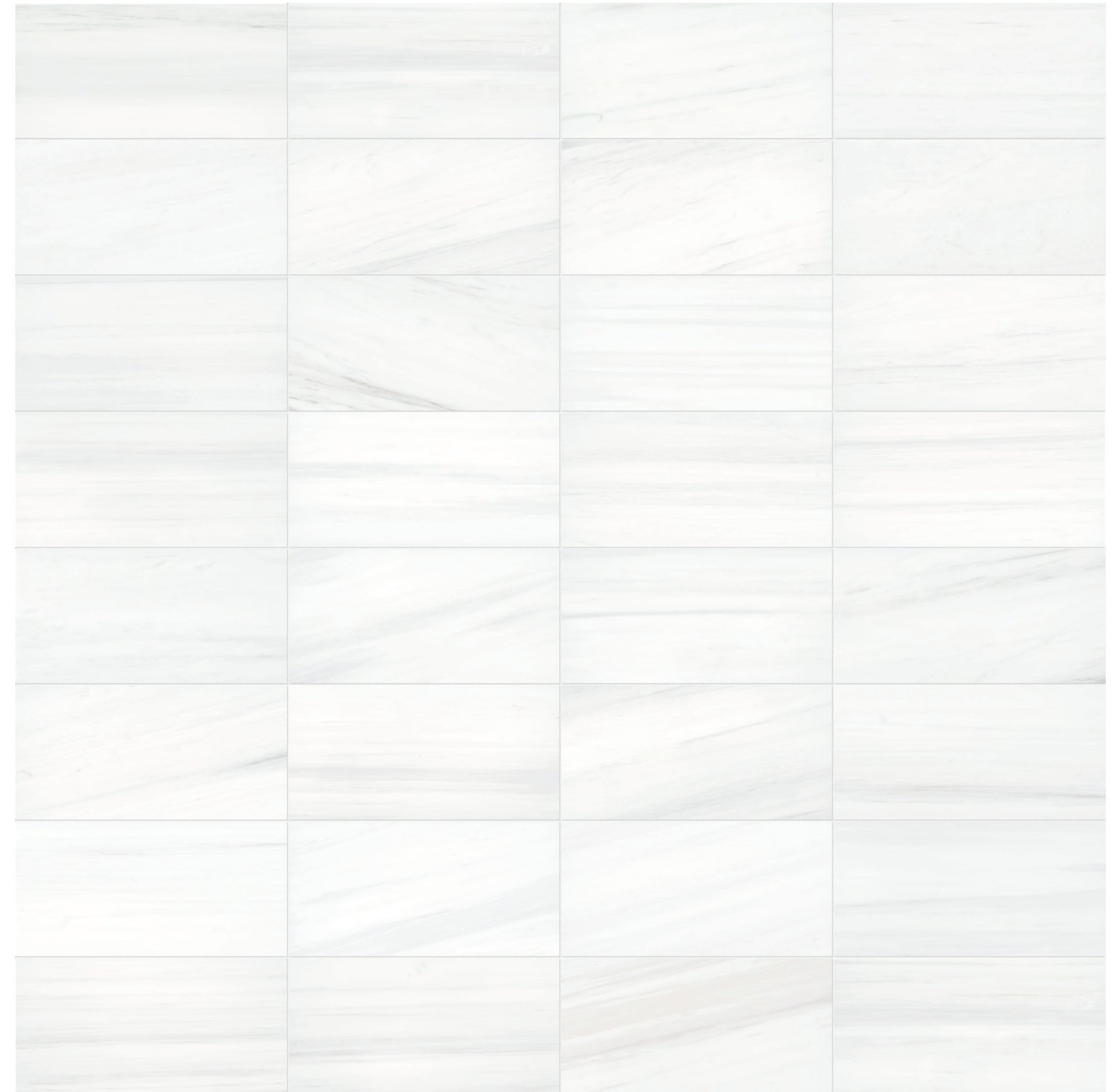
12 x 24 in / 30.5 x 61 cm tile variations

The inherent beauty of natural stone products is expressed through variations in color, texture, shading and veining.