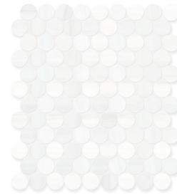
1.25 in / 3 cm Penny Round Mosaic Honed 5001-0283-0