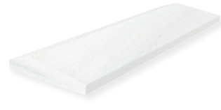
4 x 12 in / 10 x 30.5 cm Prisma Honed 5000-0369-0