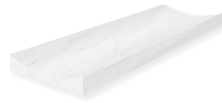
4 x 12 in / 10 x 30.5 cm Fluto Honed 5000-0368-0