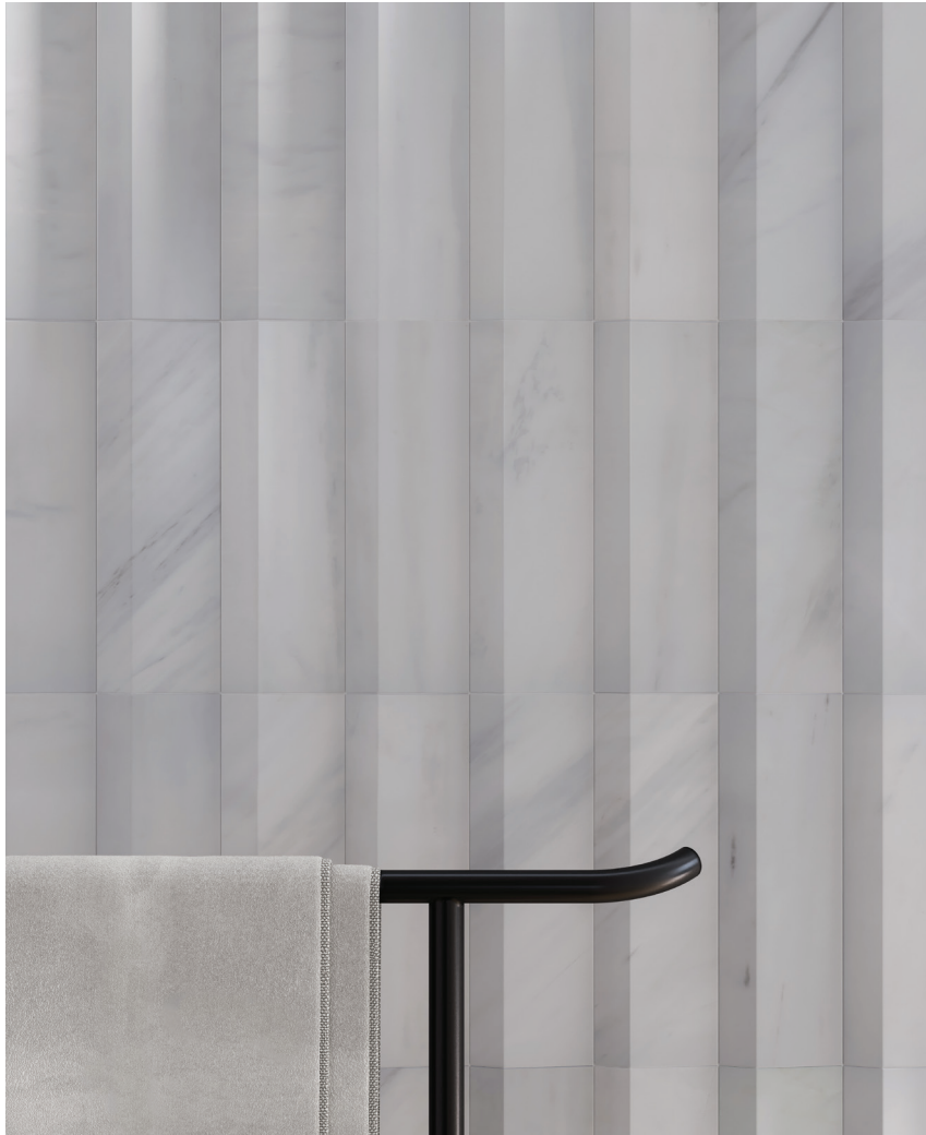
4 x 12 in / 10 x 30.5 cm Cosmo Lumino Prisma Honed Dolomite Tile