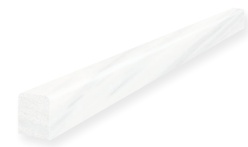
1/2 x 12 in / 1.3 x 30.5 cm Deco-Bar Honed 5002-0093-0