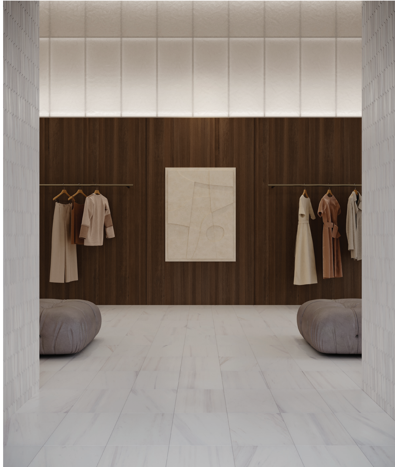
2 x 6 in / 4.9 x 15 cm Cosmo Lumino Picket Honed Dolomite Mosaic On the floor: 12 x 24 in / 30.5 x 61 cm Cosmo Lumino Honed Dolomite Tile