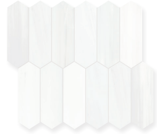
2 x 6 in / 4.9 x 15 cm Picket Mosaic Honed 5001-0282-0