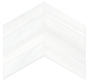
2 x 8.5 in / 5.3 x 21.3 cm Chevron Mosaic Honed 5001-0281-0