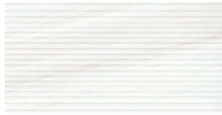
12 x 24 in / 30.5 x 61 cm Curva Honed 5000-0366-0