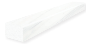
1.25 x 12 in / 3.2 x 30.5 cm Deco-Bar Honed 5002-0094-0