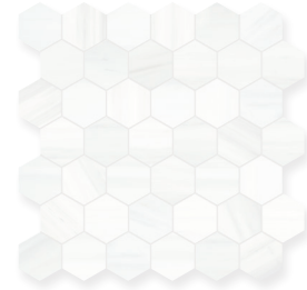
2 in / 4.9 cm Hexagon Mosaic Honed 5001-0280-0