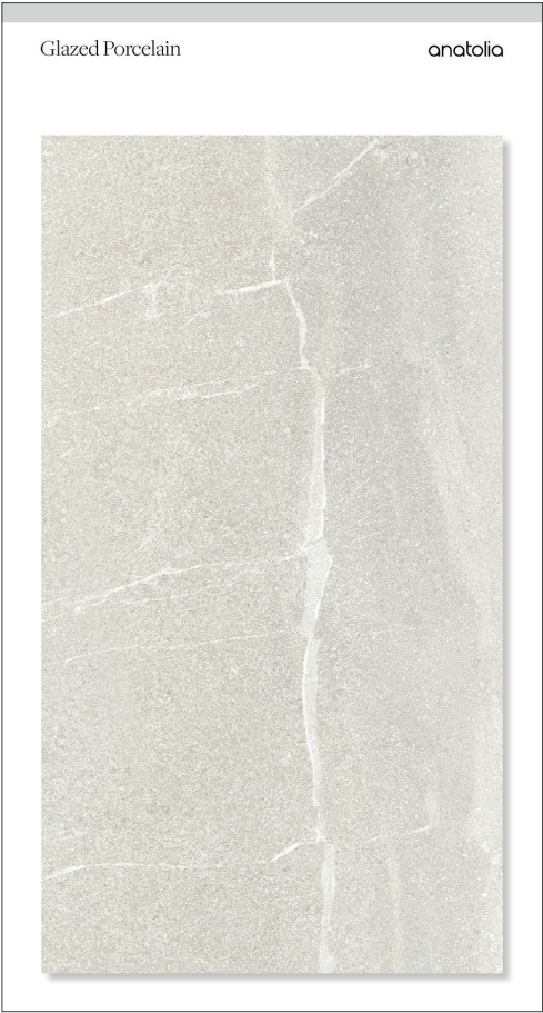
Backer Board Size: 3.25 x 6 in / 8.25 x 15.25 cm

Anatolia has created a sample chip program that categorizes sample chips into color coded material types, includes a sample chip affixed to an elegant backer card and includes all of the key technical information and formats for that color on its back label. Anatolia also developed a premium sample chip carrying case to easily and beautifully store, organize, and carry sample chips to meetings.