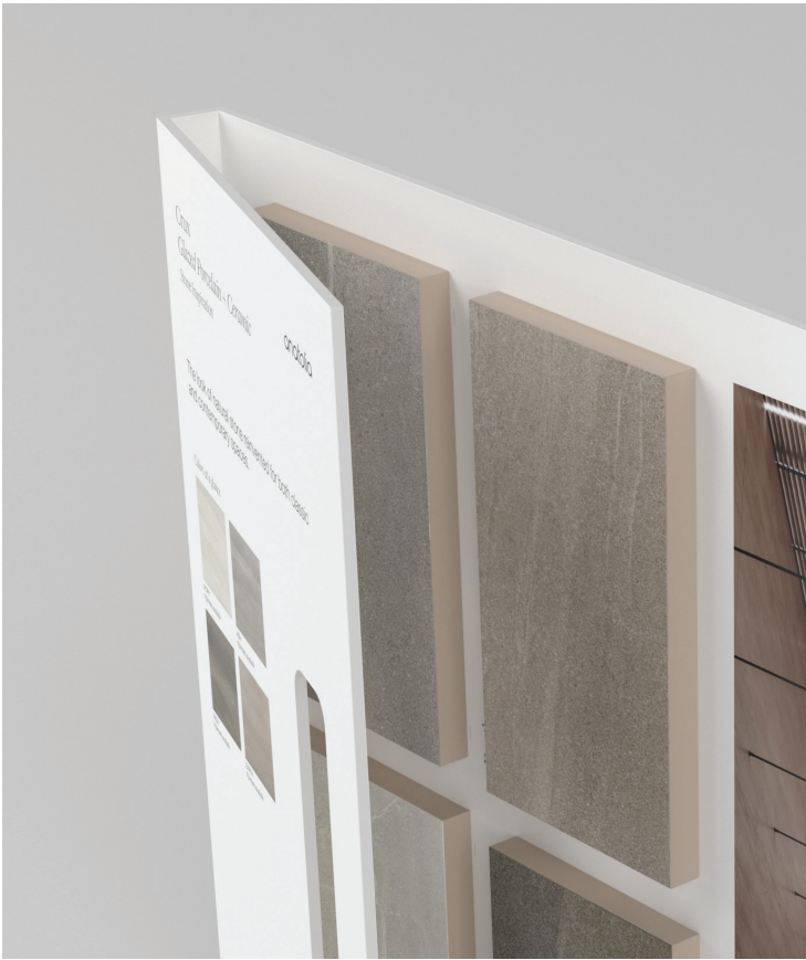
A&D Board Inside