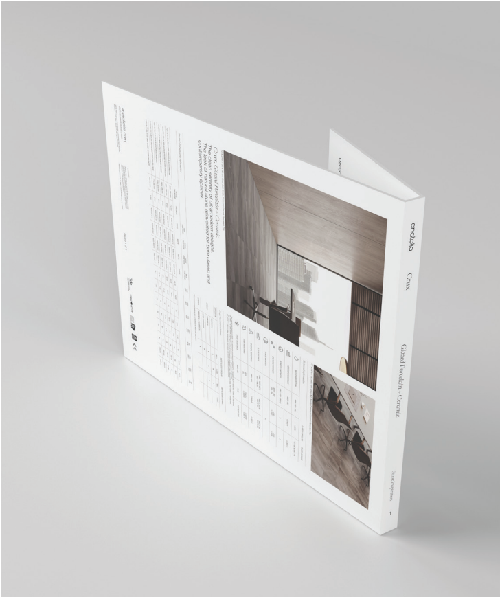
A&D Board Outside

This unique to Anatolia A&D board sits on shelf folded with a book like spine that clearly identifies the collection name, material type and corresponding inspiration for the collection. When pulled out slightly, one can easily see the collection's colors at a glance.