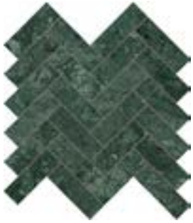
1.25 x 4 in / 3.3 x 10 cm Herringbone Mosaic Polished 5001-0334-0