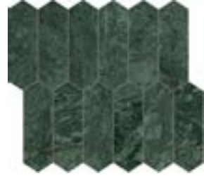
2 x 6 in / 4.9 x 15 cm Picket Mosaic Polished 5001-0335-0