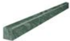
1/2 x 12 in / 1.3 x 30.5 cm Deco-Bar Polished 5002-0127-0