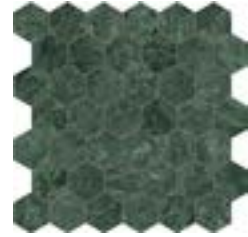
2 in / 4.9 cm Hexagon Mosaic Polished 5001-0333-0