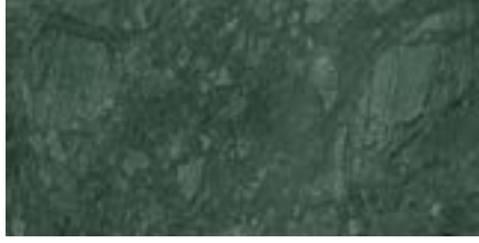
12 x 24 in / 30.5 x 61 cm Polished 5000-0660-0