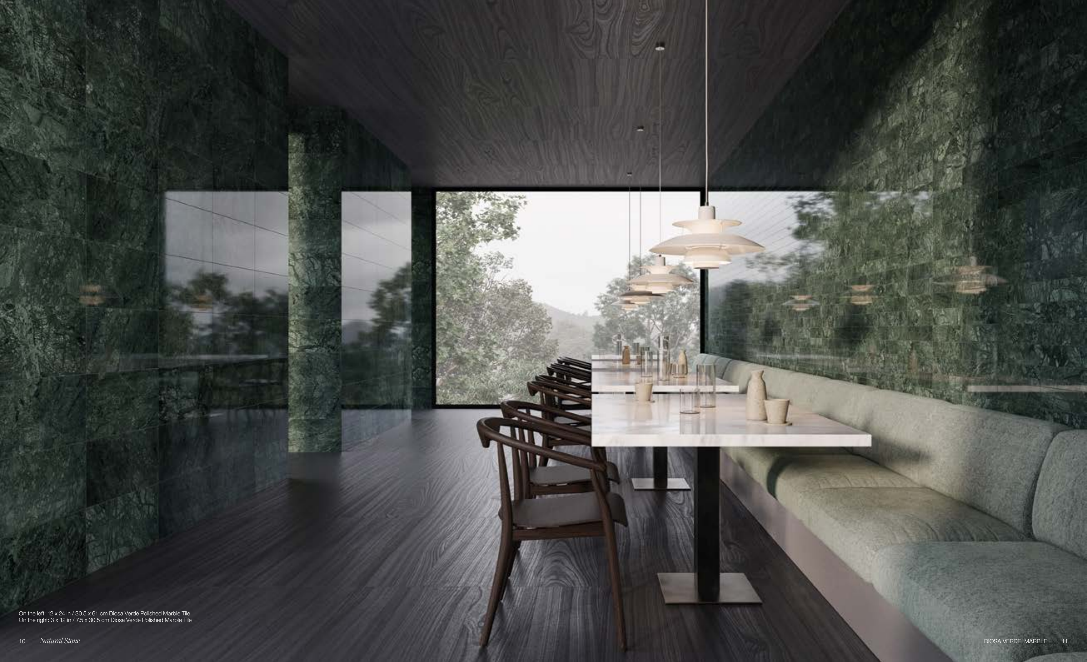
On the left: 12 x 24 in / 30.5 x 61 cm Diosa Verde Polished Marble Tile On the right: 3 x 12 in / 7.5 x 30.5 cm Diosa Verde Polished Marble Tile