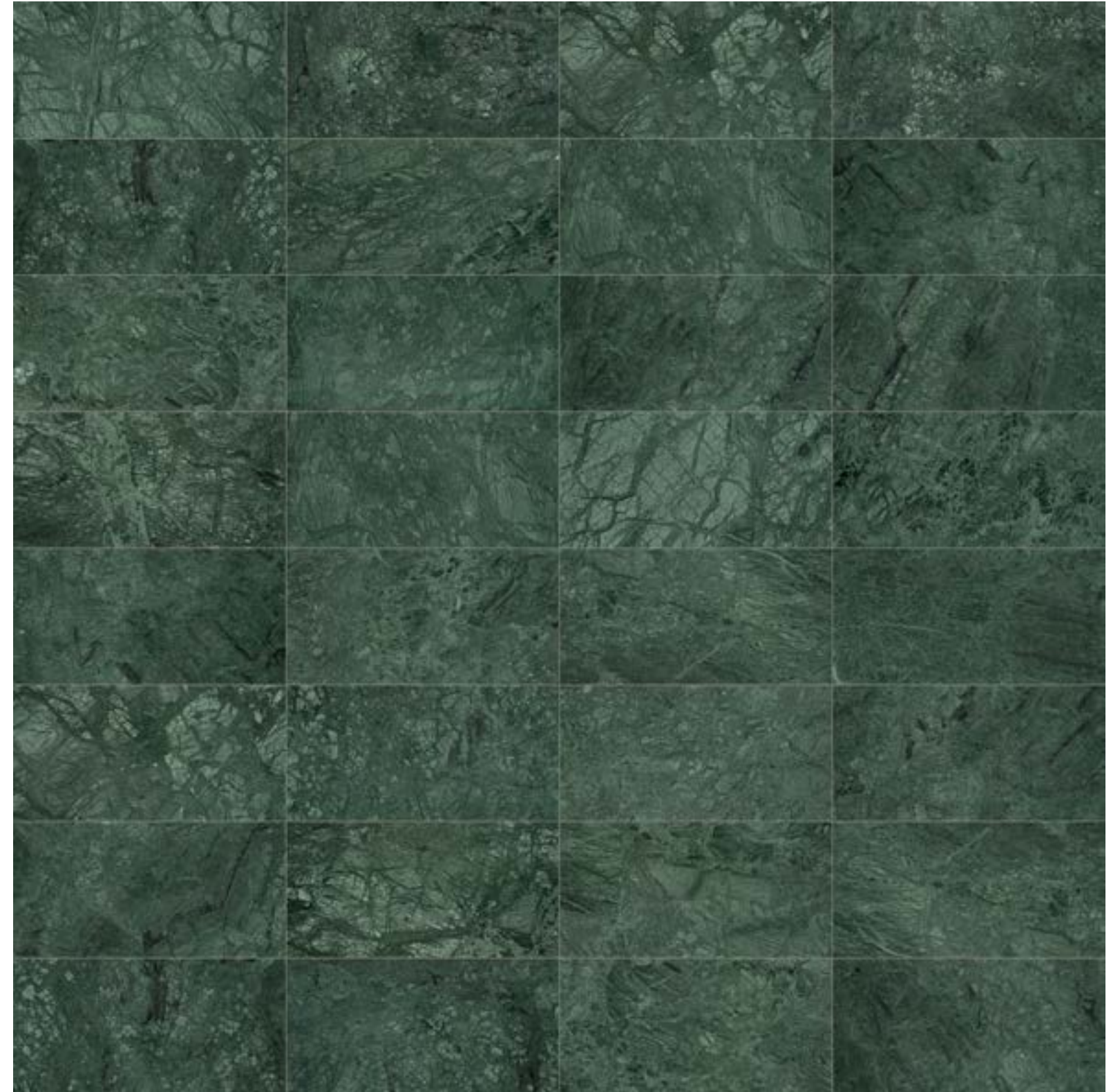
12 x 24 in / 30.5 x 61 cm tile variations

The inherent beauty of natural stone products is expressed through variations in color, texture, shading and veining.