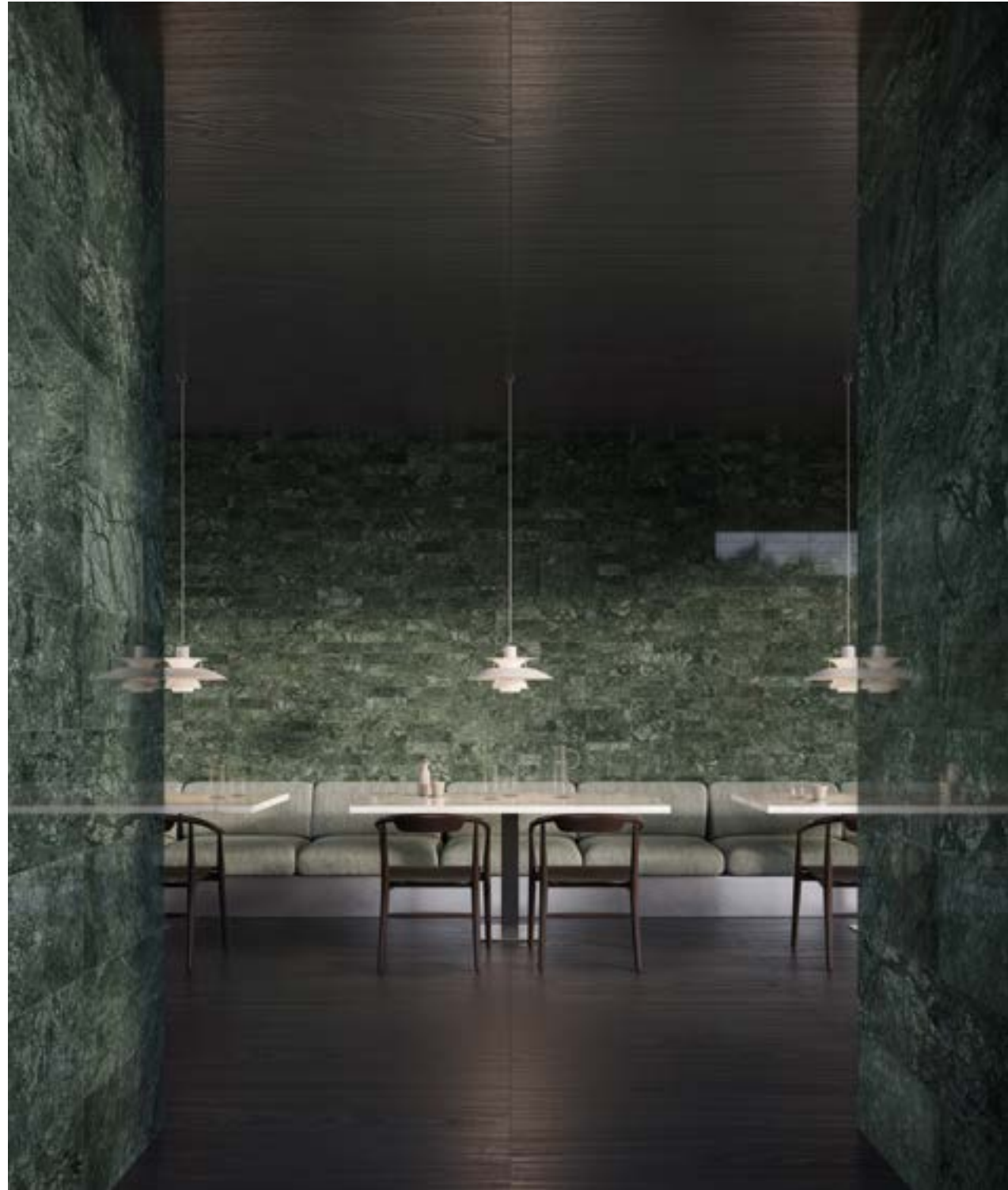
12 x 24 in / 30.5 x 61 cm Diosa Verde Polished Marble Tile On the back wall: 3 x 12 in / 7.5 x 30.5 cm Diosa Verde Polished Marble Tile