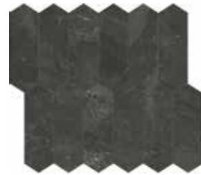
2 x 6 in / 4.9 x 15 cm Picket Mosaic Polished 5001-0303-0