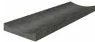
4 x 12 in / 10 x 30 cm Fluto Polished 5000-0643-0