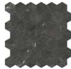
2 in / 4.9 cm Hexagon Mosaic Polished 5001-0301-0