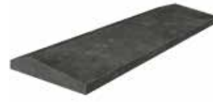
4 x 12 in / 10 x 30 cm Prisma Polished 5000-0644-0