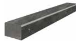
1.25 x 12 in / 3.2 x 30.5 cm Deco-Bar Polished 5002-0112-0