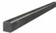
1/2 x 12 in / 1.3 x 30.5 cm Deco-Bar Polished 5002-0111-0