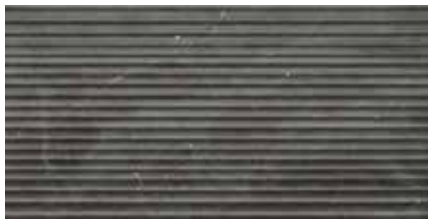
12 x 24 in / 30.5 x 61 cm Curva Polished 5000-0642-0