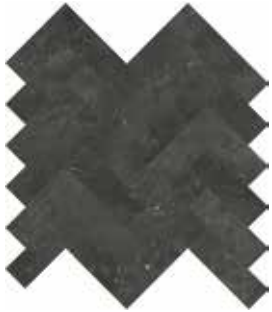
1.25 x 4 in / 3.3 x 10 cm Herringbone Mosaic Polished 5001-0302-0