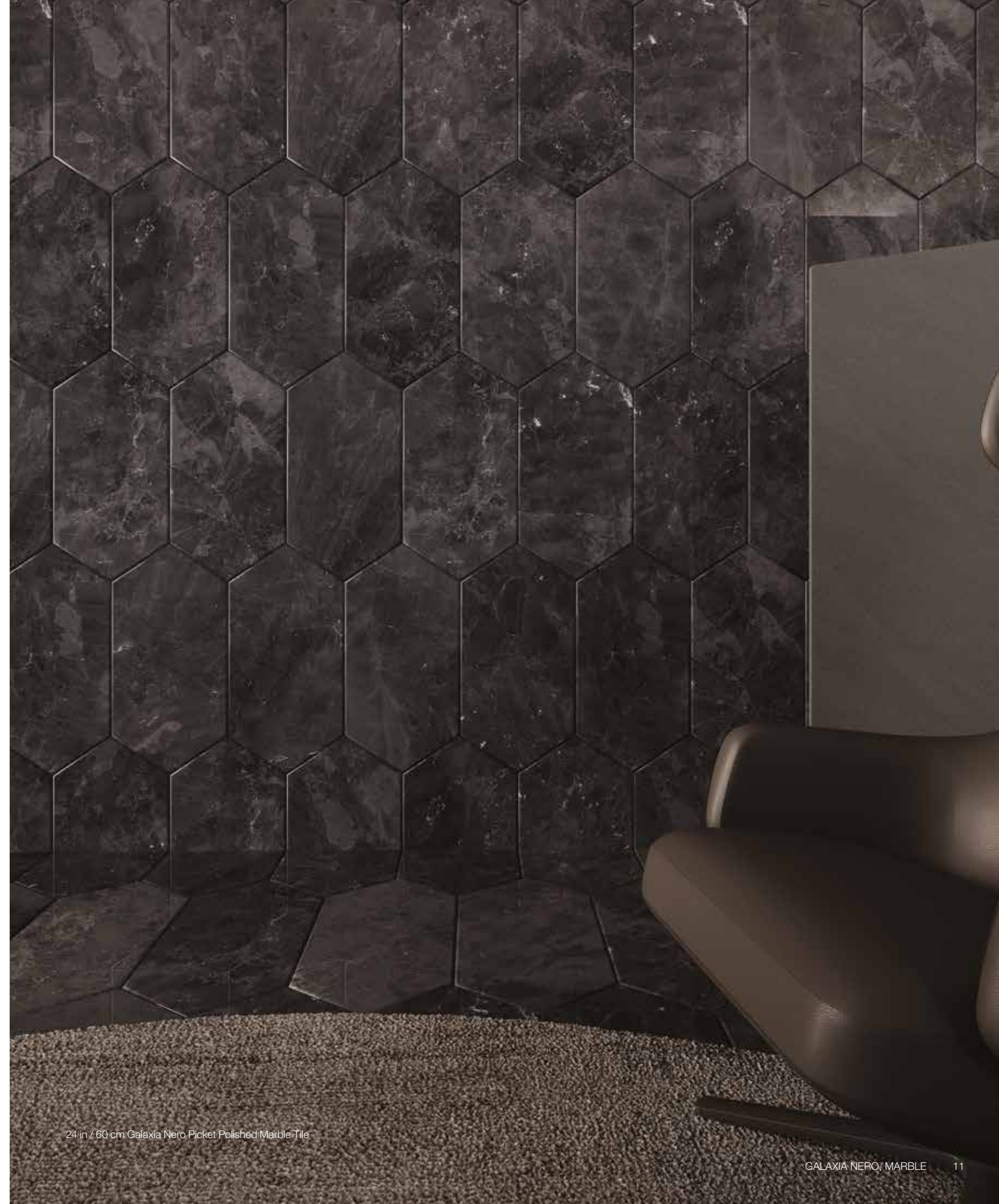
24 in / 60 cm Galaxia Nero Picket Polished Marble Tile

Galaxia Nero's dark background is traversed by seams of grey, evoking both the earth's fault lines and the infinite profundities of outer space.