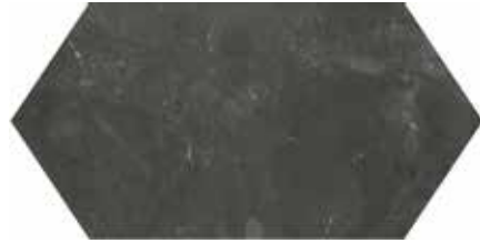
24 in / 60 cm Picket Polished 5000-0641-0