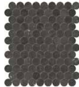
1.25 in / 3 cm Penny Round Mosaic Polished 5001-0304-0