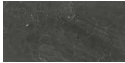
12 x 24 in / 30.5 x 61 cm Polished 5000-0624-0