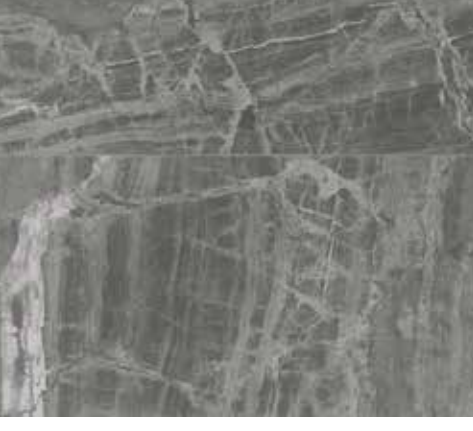
18 x 36 in / 45.7 x 91.4 cm tile variations