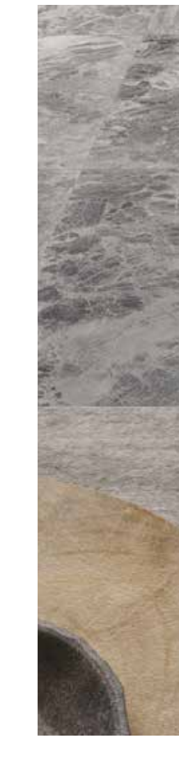
18 x 36 in / 45.7 x 91.4 cm Gemma Mystique Brushed Marble Tile