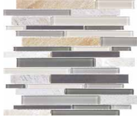
Fossil Rock Random Strip Mosaic 3001-0136-0