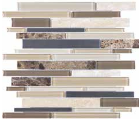
Woodland Park Random Strip Mosaic 3001-0135-0