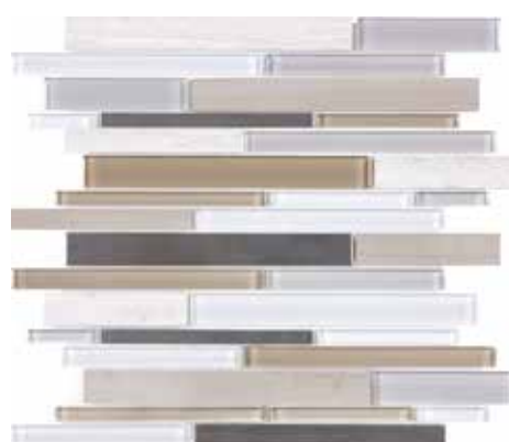
Twilight Mist Random Strip Mosaic 3001-0134-0