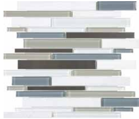
Nordic Storm Random Strip Mosaic 3001-0132-0