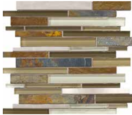
Nature Trail Random Strip Mosaic 3001-0137-0