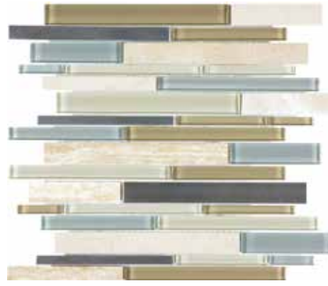
Sea Coast Random Strip Mosaic 3001-0133-0