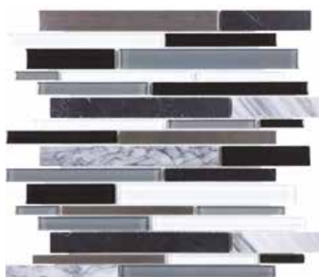
Arctic Night Random Strip Mosaic 3001-0130-0