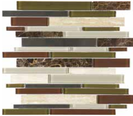
Deep Grotto Random Strip Mosaic 3001-0131-0