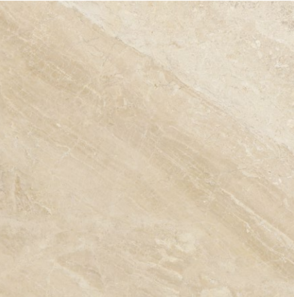
24 x 24 in / 61 x 61 cm Polished 5000-0081-1 Honed 5000-0082-1