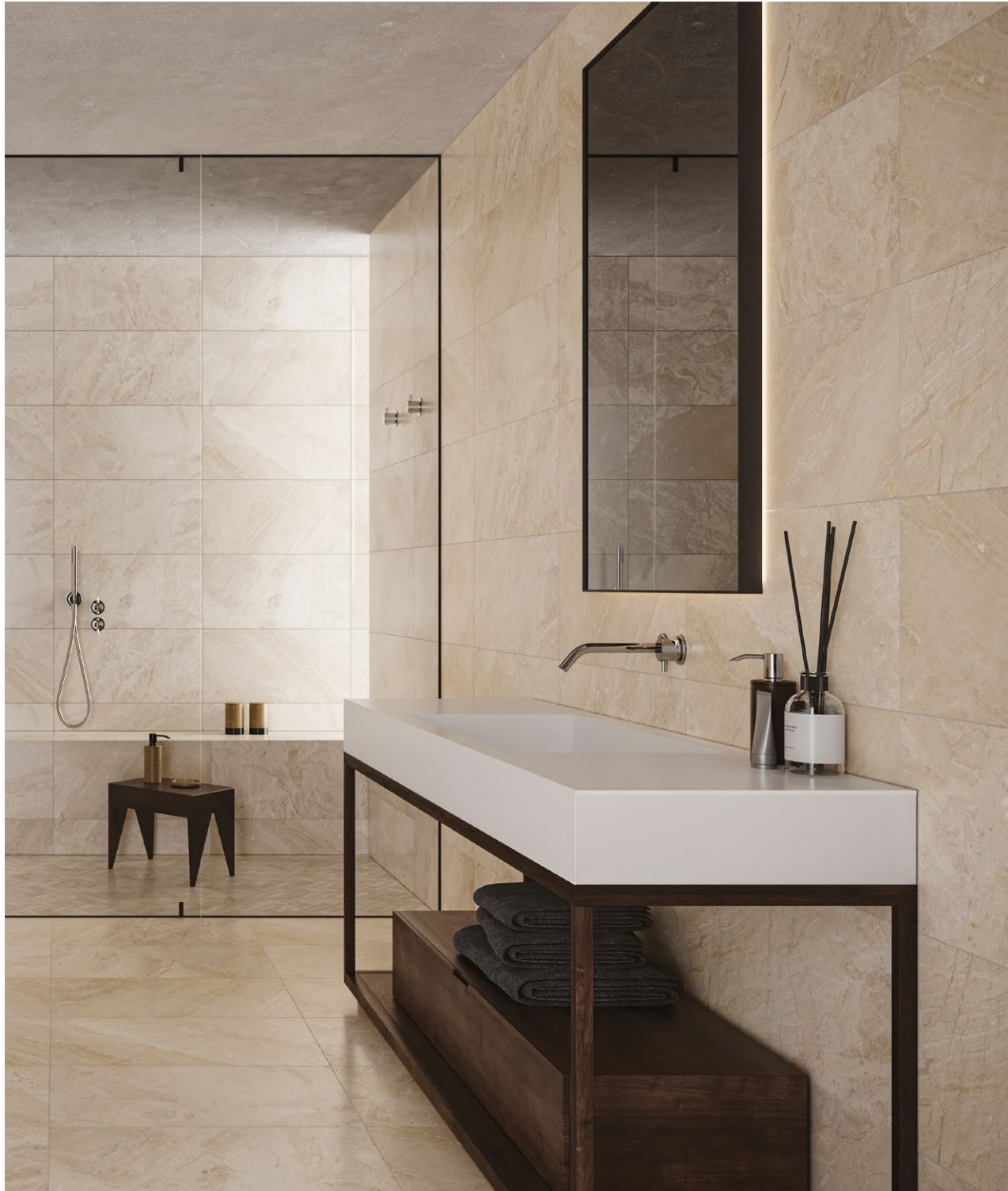
12 x 24 in / 30.5 x 61 cm Impero Reale Honed Marble Tile