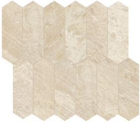
2 x 6 in / 4.9 x 15 cm Picket Mosaic Polished 5001-0296-0 Honed 5001-0295-0