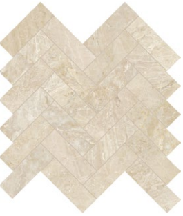
1.25 x 4 in / 3.3 x 10 cm Herringbone Mosaic Polished 5001-0294-0 Honed 5001-0293-0