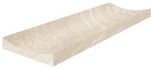
4 x 12 in / 10 x 30 cm Fluto Honed 5000-0629-0