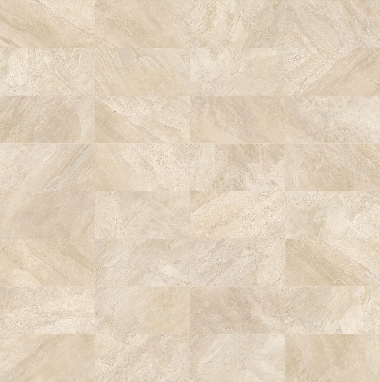
12 x 24 in / 30.5 x 61 cm image variations

The inherent beauty of natural stone products is expressed through variations in color, texture, shading and veining.