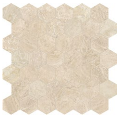
2 in / 4.9 cm Hexagon Mosaic Polished 5001-0292-0 Honed 5001-0291-0