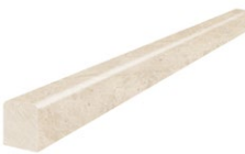
1/2 x 12 in / 1.3 x 30.5 cm Deco-Bar Polished 5002-0102-0 Honed 5002-0101-0

The inherent beauty of natural stone products is expressed through variations in color, texture, shading and veining.