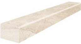
1.25 x 12 in / 3.2 x 30.5 cm Deco-Bar Honed 5002-0103-0