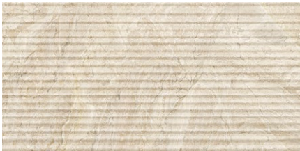
12 x 24 in / 30.5 x 61 cm Curva Honed 5000-0628-0