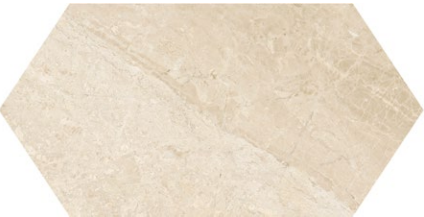
24 in / 60 cm Picket Honed 5000-0385-0