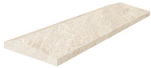
4 x 12 in / 10 x 30 cm Prisma Honed 5000-0630-0