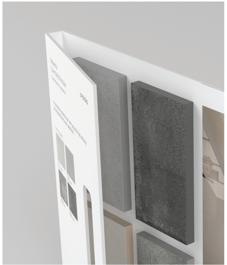
A&D Board Inside