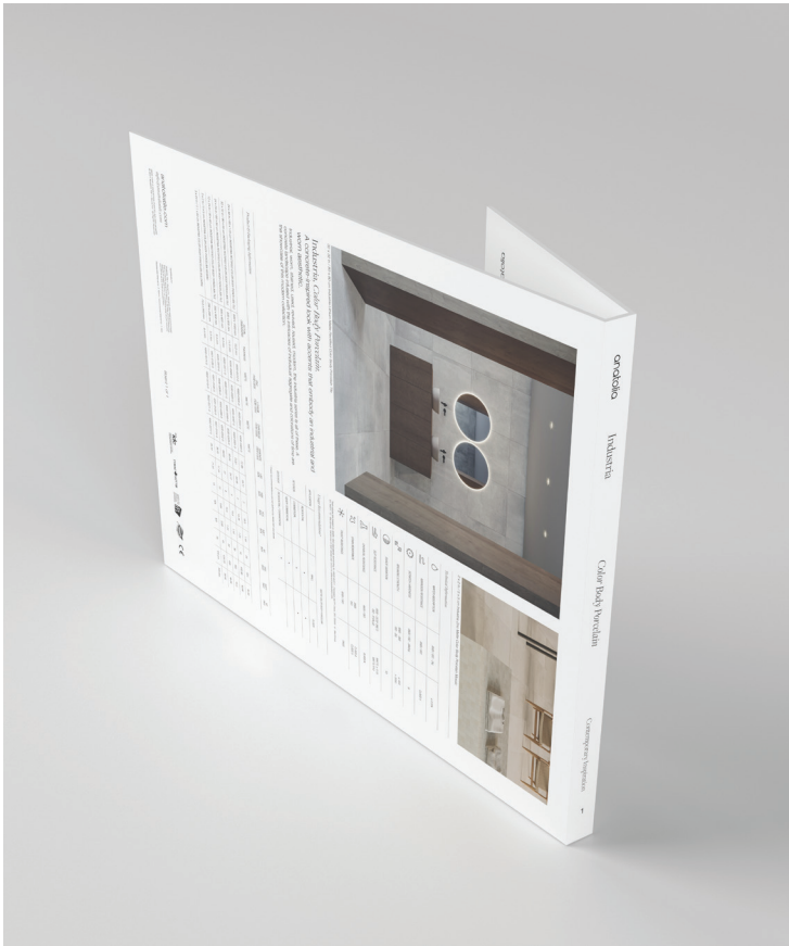
A&D Board Outside

This unique to Anatolia A&D board sits on shelf folded with a book like spine that clearly identifies the collection name, material type and corresponding inspiration for the collection. When pulled out slightly, one can easily see the collection's colors at a glance.