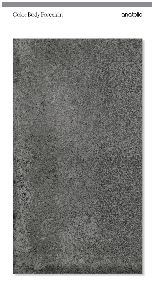
Backer Board Size: 3.25 x 6 in / 8.25 x 15.25 cm

Anatolia has created a sample chip program that categorizes sample chips into color coded material types, includes a sample chip affixed to an elegant backer card and includes all of the key technical information and formats for that color on its back label. Anatolia also developed a premium sample chip carrying case to easily and beautifully store, organize, and carry sample chips to meetings.