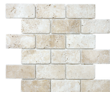
2 x 4 in / 5 x 10 cm Brick Mosaics Tumbled 5001-0066-0