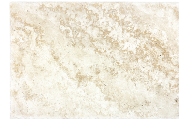
16 x 24 in / 40.6 x 61 cm Chiseled & Brushed 5000-0098-0