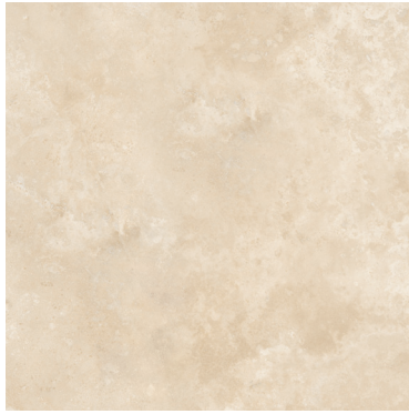
24 x 24 in / 61 x 61 cm Filled & Honed 5000-0102-0