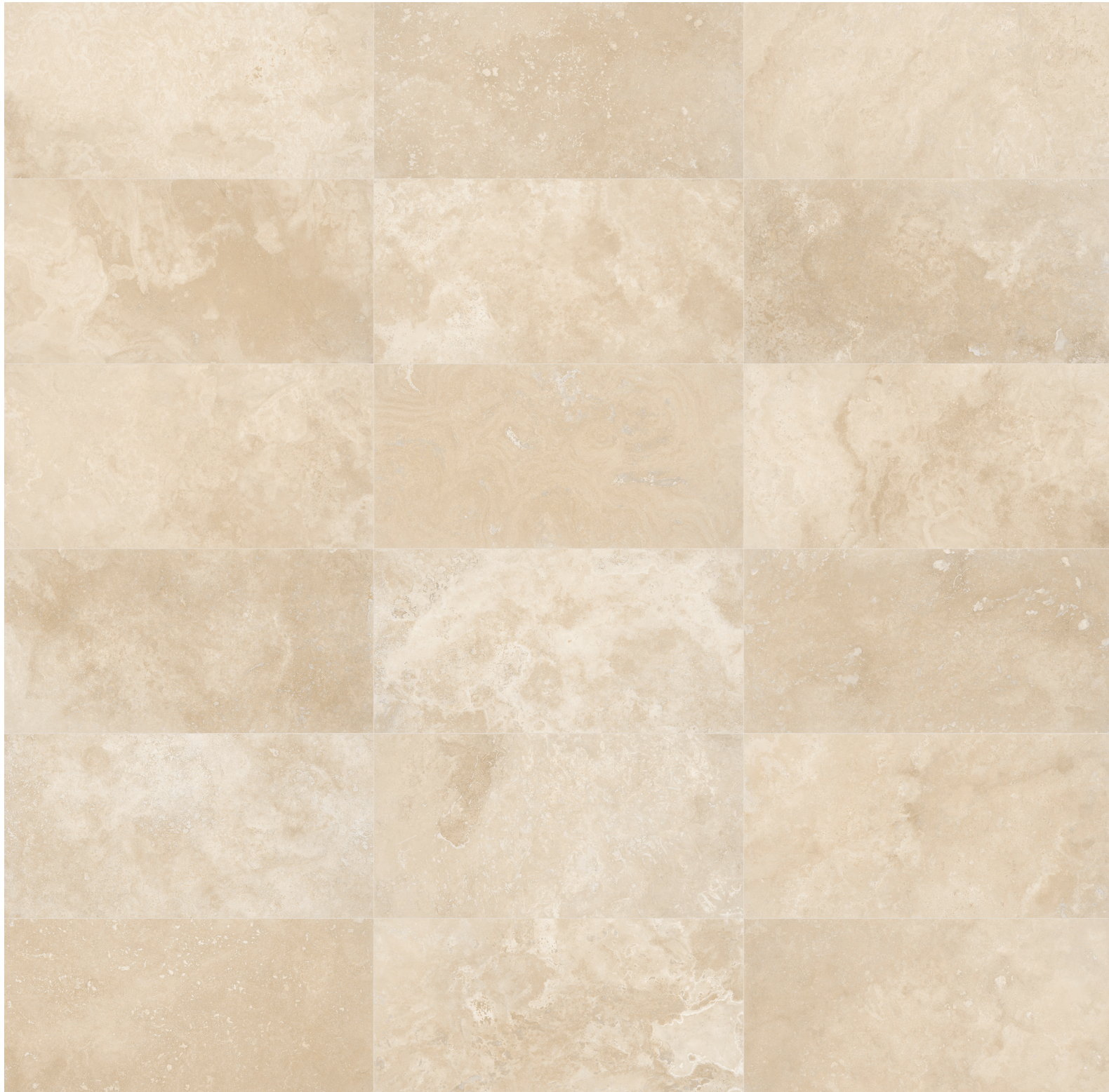
FILLED & HONED (B) 12 x 24 in / 30 x 60 cm image variations