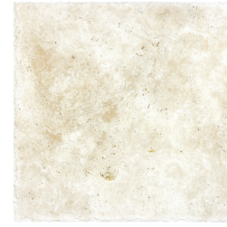
16 x 16 in / 40.6 x 40.6 cm Chiseled & Brushed 5000-0097-0