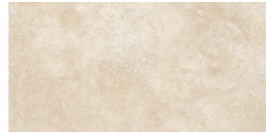
12 x 24 in / 30 x 60 cm Filled & Honed 5000-0096-0