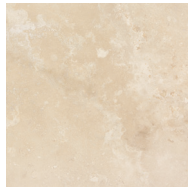
12 x 12 in / 30.5 x 30.5 cm Filled & Honed 5000-0095-0