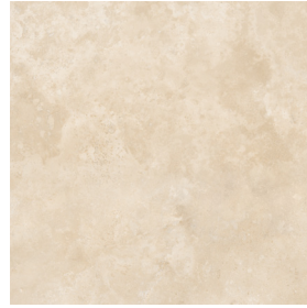
18 x 18 in / 45 x 45 cm Filled & Honed 5000-0101-0