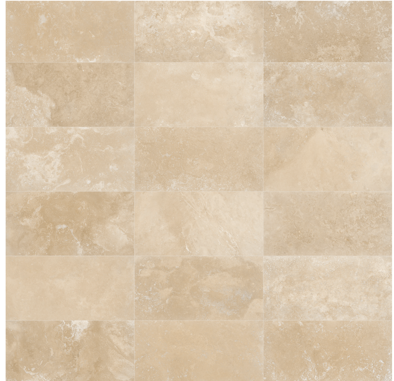
FILLED & HONED (C) 12 x 24 in / 30 x 60 cm image variations