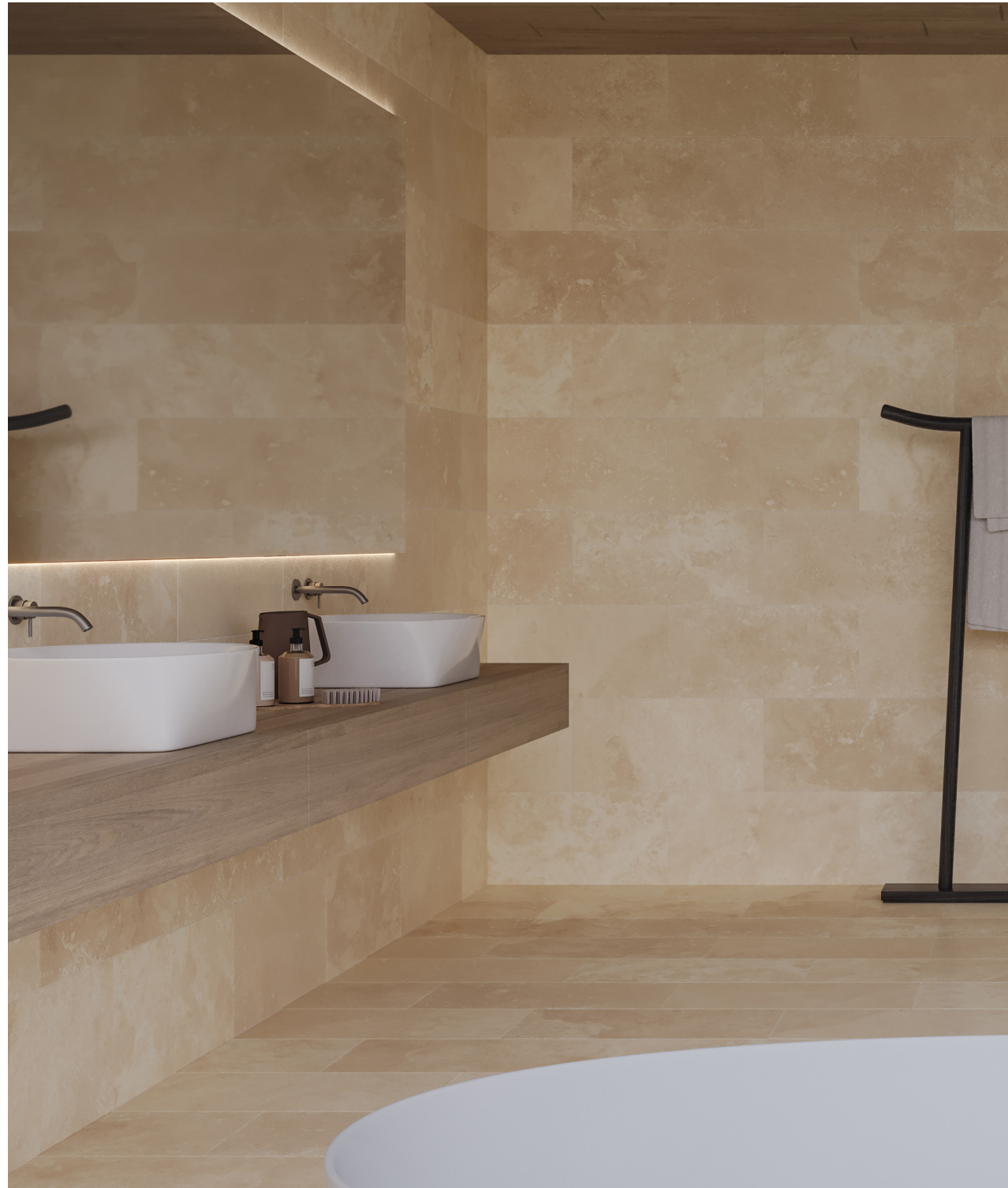
12 x 24 in / 30 x 60 cm Ivory Filled & Honed Travertine Tile