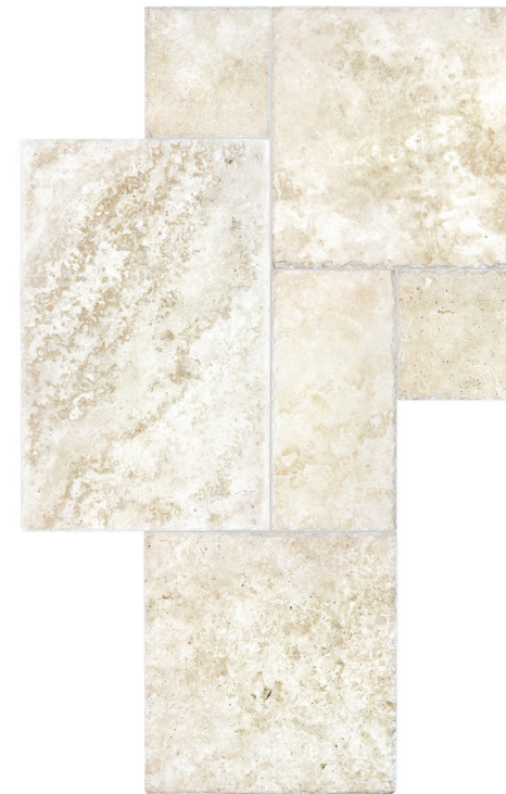
Cobble Stone Pattern Set Chiseled & Brushed 5000-0103-0