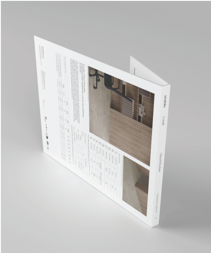
A&D Board Outside

This unique to Anatolia A&D board sits on shelf folded with a book like spine that clearly identifies the collection name, material type and corresponding inspiration for the collection. When pulled out slightly, one can easily see the collection's colors at a glance.