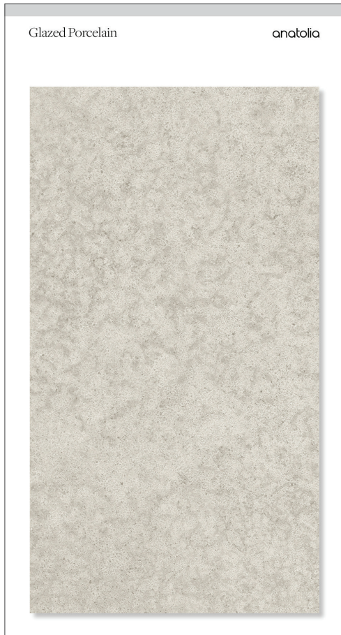
Backer Board Size: 3.25 x 6 in / 8.25 x 15.25 cm

Anatolia has created a sample chip program that categorizes sample chips into color coded material types, includes a sample chip affixed to an elegant backer card and includes all of the key technical information and formats for that color on its back label. Anatolia also developed a premium sample chip carrying case to easily and beautifully store, organize, and carry sample chips to meetings.