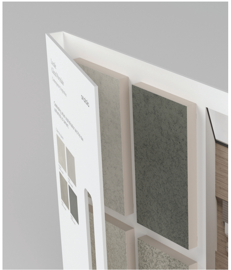
A&D Board Inside