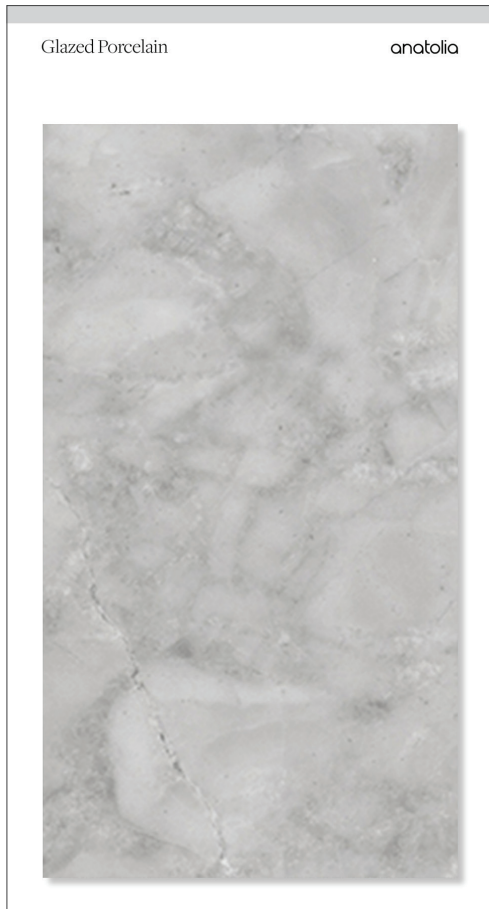
Backer Board Size: 3.25 x 6 in / 8.25 x 15.25 cm

Anatolia has created a sample chip program that categorizes sample chips into color coded material types, includes a sample chip affixed to an elegant backer card and includes all of the key technical information and formats for that color on its back label. Anatolia also developed a premium sample chip carrying case to easily and beautifully store, organize, and carry sample chips to meetings.