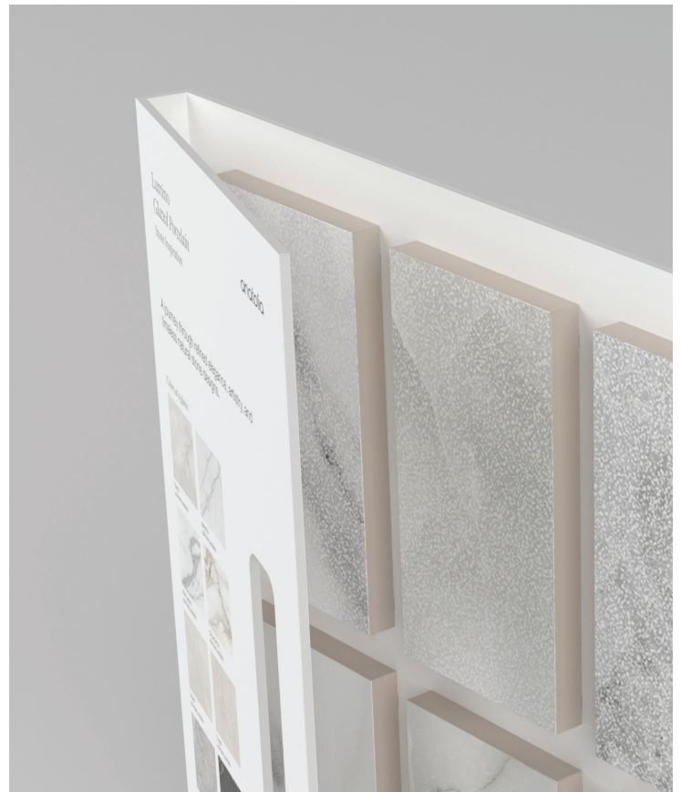
A&D Board Inside