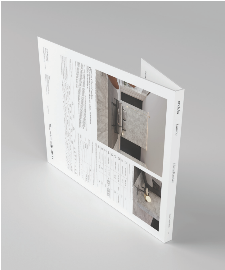
A&D Board Outside

This unique to Anatolia A&D board sits on shelf folded with a book like spine that clearly identifies the collection name, material type and corresponding inspiration for the collection. When pulled out slightly, one can easily see the collection's colors at a glance.