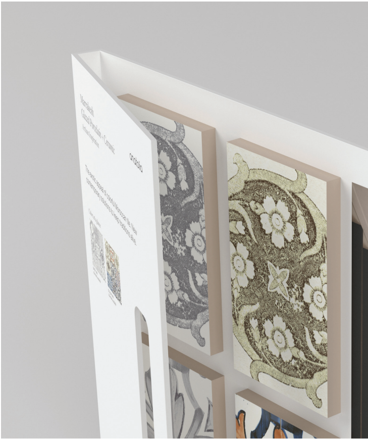
A&D Board Inside