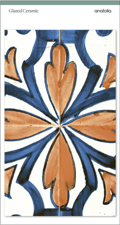
Backer Board Size: 3.25 x 6 in / 8.25 x 15.25 cm

Anatolia has created a sample chip program that categorizes sample chips into color coded material types, includes a sample chip affixed to an elegant backer card and includes all of the key technical information and formats for that color on its back label. Anatolia also developed a premium sample chip carrying case to easily and beautifully store, organize, and carry sample chips to meetings.