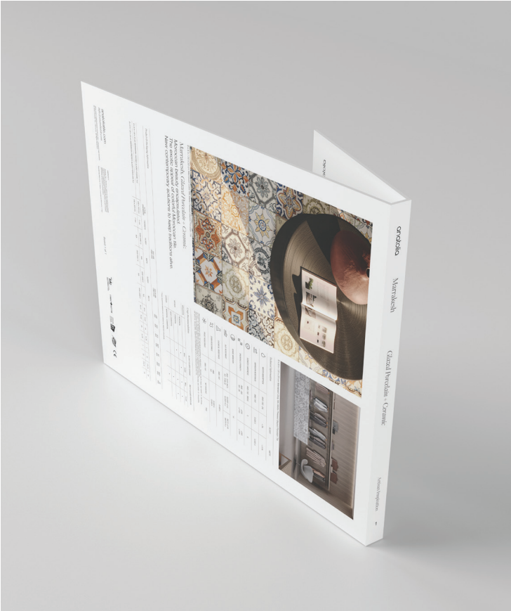
A&D Board Outside

This unique to Anatolia A&D board sits on shelf folded with a book like spine that clearly identifies the collection name, material type and corresponding inspiration for the collection. When pulled out slightly, one can easily see the collection's colors at a glance.