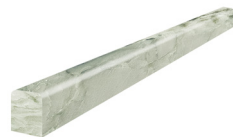
1/2 x 12 in / 1.3 x 30.5 cm Deco-Bar Honed 5002-0129-0