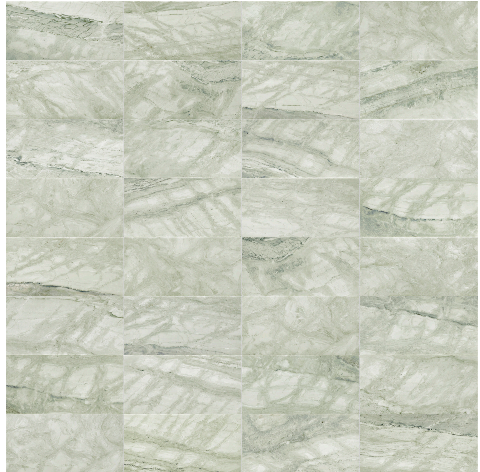
12 x 24 in / 30.5 x 61 cm tile variations

The inherent beauty of natural stone products is expressed through variations in color, texture, shading and veining.