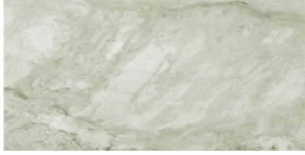
12 x 24 in / 30.5 x 61 cm Honed 5000-0664-0