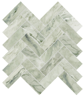
1.25 x 4 in / 3.3 x 10 cm Herringbone Mosaic Honed 5001-0368-0