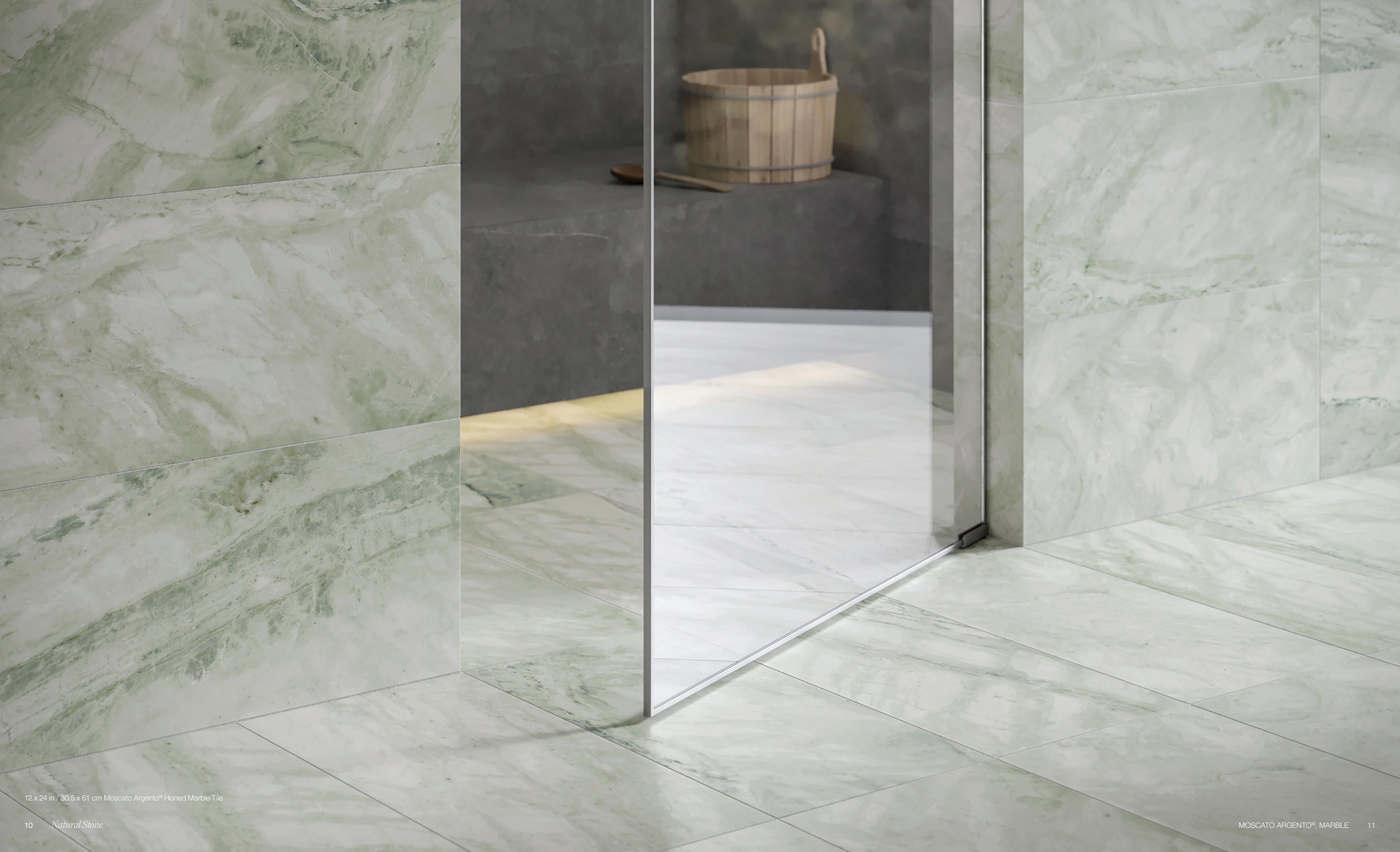
12 x 24 in / 30.5 x 61 cm Moscato Argento® Honed Marble Tile