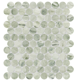
1.25 in / 3 cm Penny Round Mosaic Honed 5001-0370-0