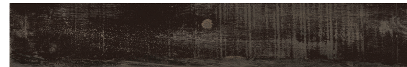
Charred 6 x 36 in / 15 x 90 cm Pressed Matte 4500-0447-0