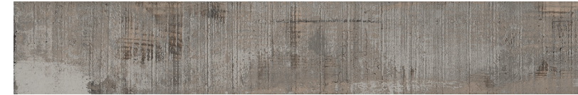
Smoke 6 x 36 in / 15 x 90 cm Pressed Matte 4500-0449-0