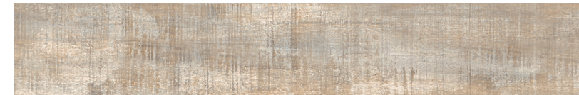
Saddle 6 x 36 in / 15 x 90 cm Pressed Matte 4500-0448-0