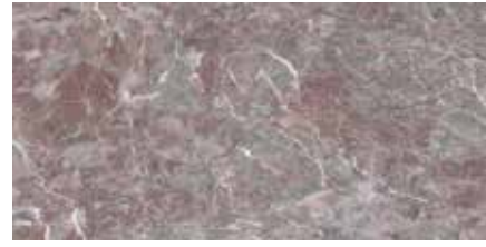
12 x 24 in / 30.5 x 61 cm Honed 5000-0621-0