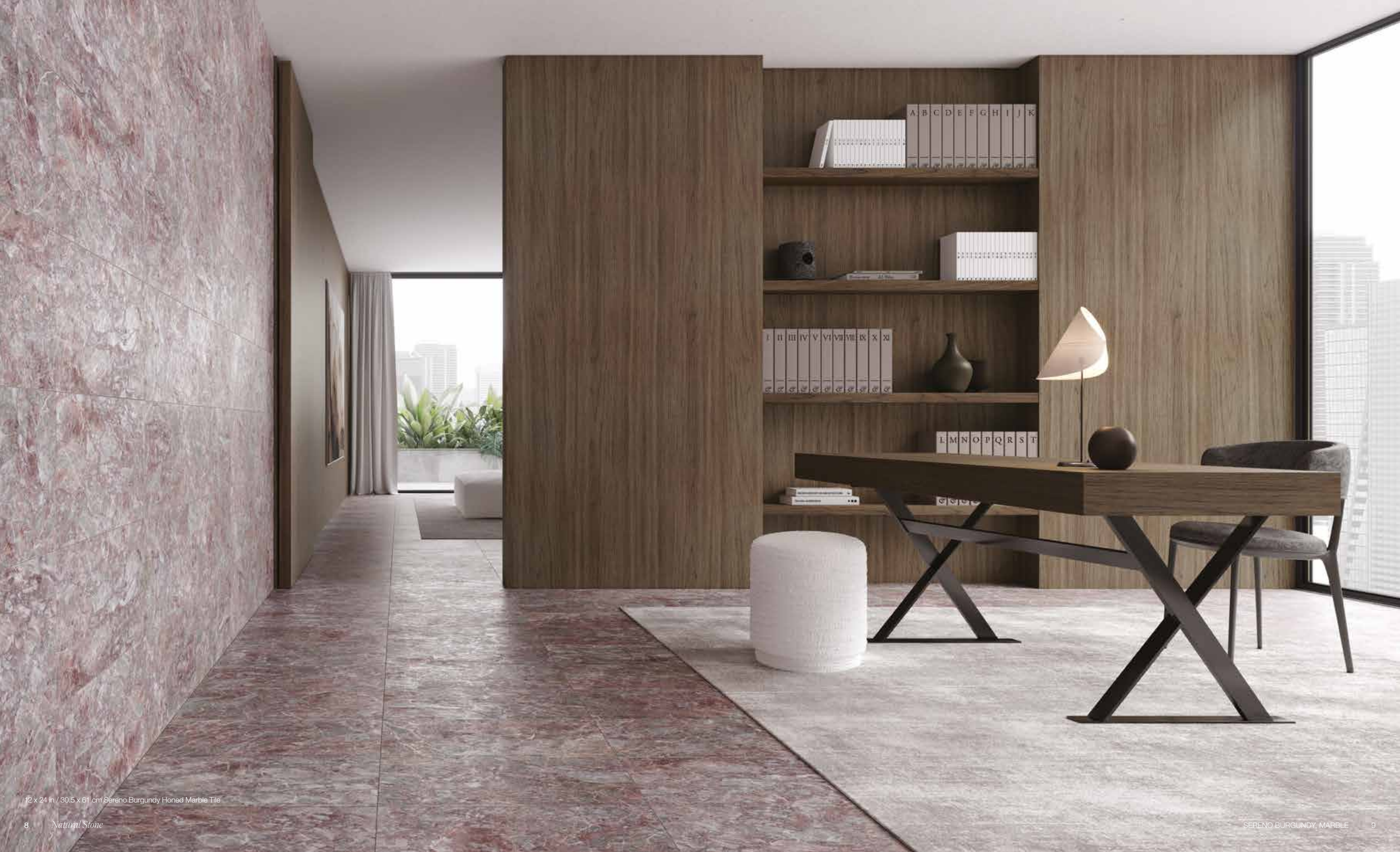
12 x 24 in / 30.5 x 61 cm Sereno Burgundy Honed Marble Tile