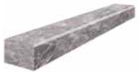
1.25 x 12 in / 3.2 x 30.5 cm Deco-Bar Honed 5002-0126-0