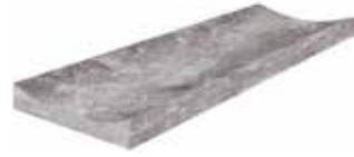
4 x 12 in / 10 x 30.5 cm Fluto Honed 5000-0656-0