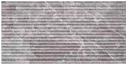
12 x 24 in / 30.5 x 61 cm Curva Honed 5000-0655-0