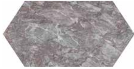
24 in / 60 cm Picket Honed 5000-0654-0