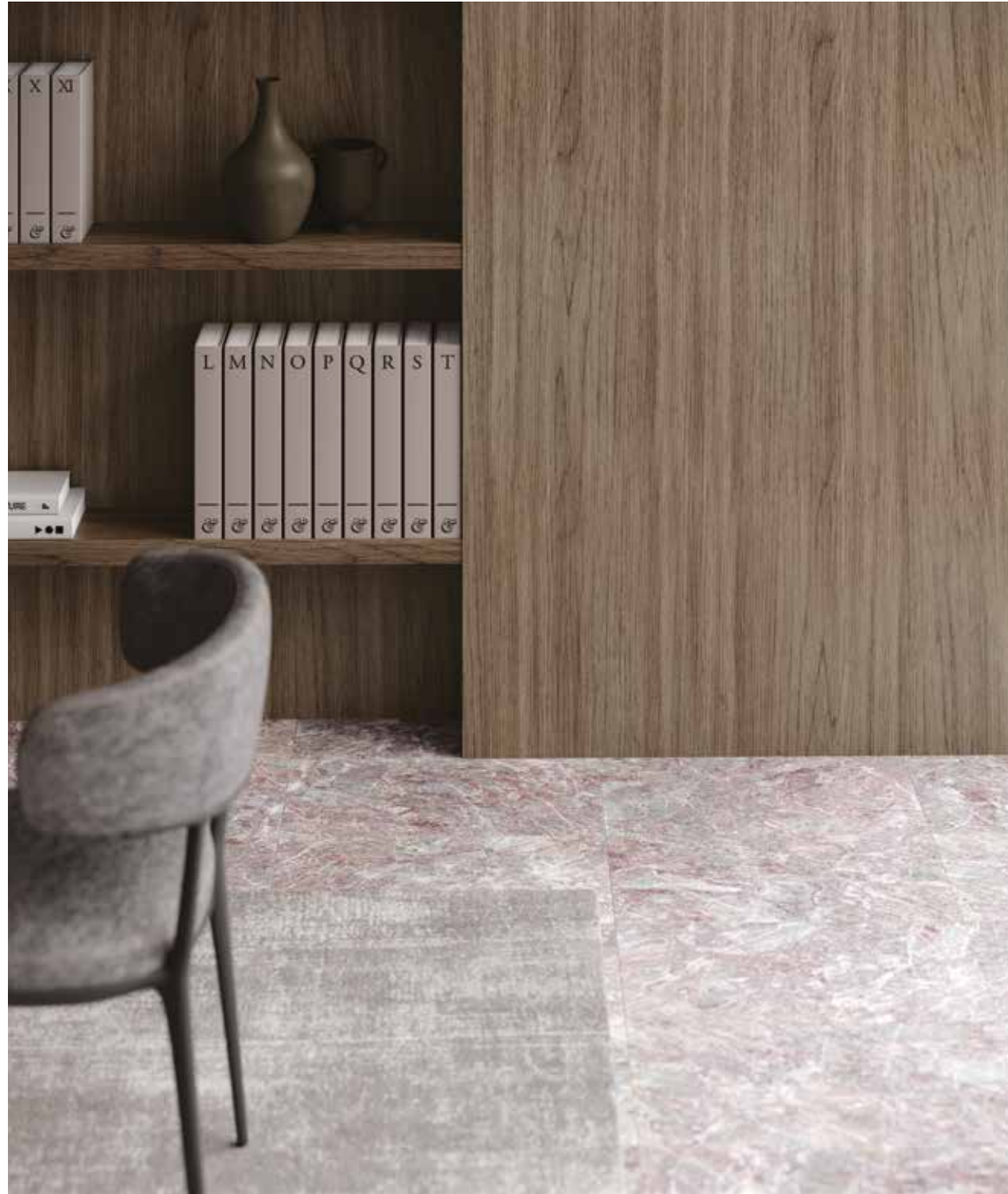
12 x 24 in / 30.5 x 61 cm Sereno Burgundy Honed Marble Tile