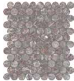
1.25 in / 3 cm Penny Round Mosaic Honed 5001-0314-0