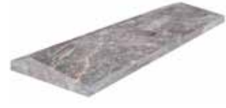
4 x 12 in / 10 x 30.5 cm Prisma Honed 5000-0657-0