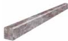
1/2 x 12 in / 1.3 x 30.5 cm Deco-Bar Honed 5002-0117-0