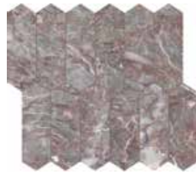
2 x 6 in / 4.9 x 15 cm Picket Mosaic Honed 5001-0313-0