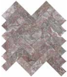
1.25 x 4 in / 3.3 x 10 cm Herringbone Mosaic Honed 5001-0312-0