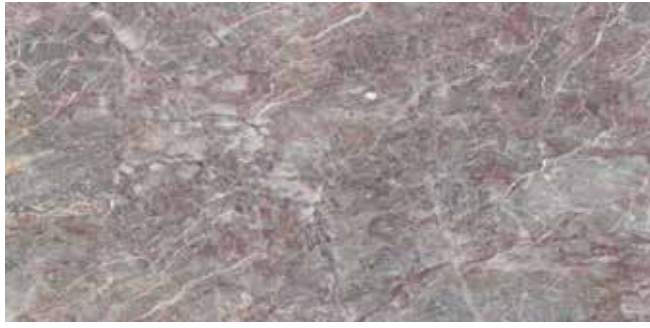
18 x 36 in / 45.7 x 91.4 cm Honed 5000-0620-0