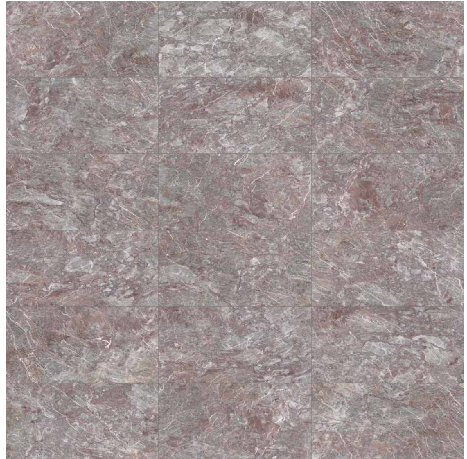
18 x 36 in / 45.7 x 91.4 cm tile variations

The inherent beauty of natural stone products is expressed through variations in color, texture, shading and veining.