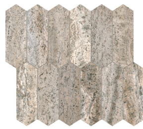
2 x 6 in / 4.9 x 15 cm Picket Mosaic Filled & Honed 5001-0317-0