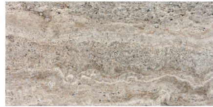
12 x 24 in / 30.5 x 61 cm Filled & Honed 5000-0233-0