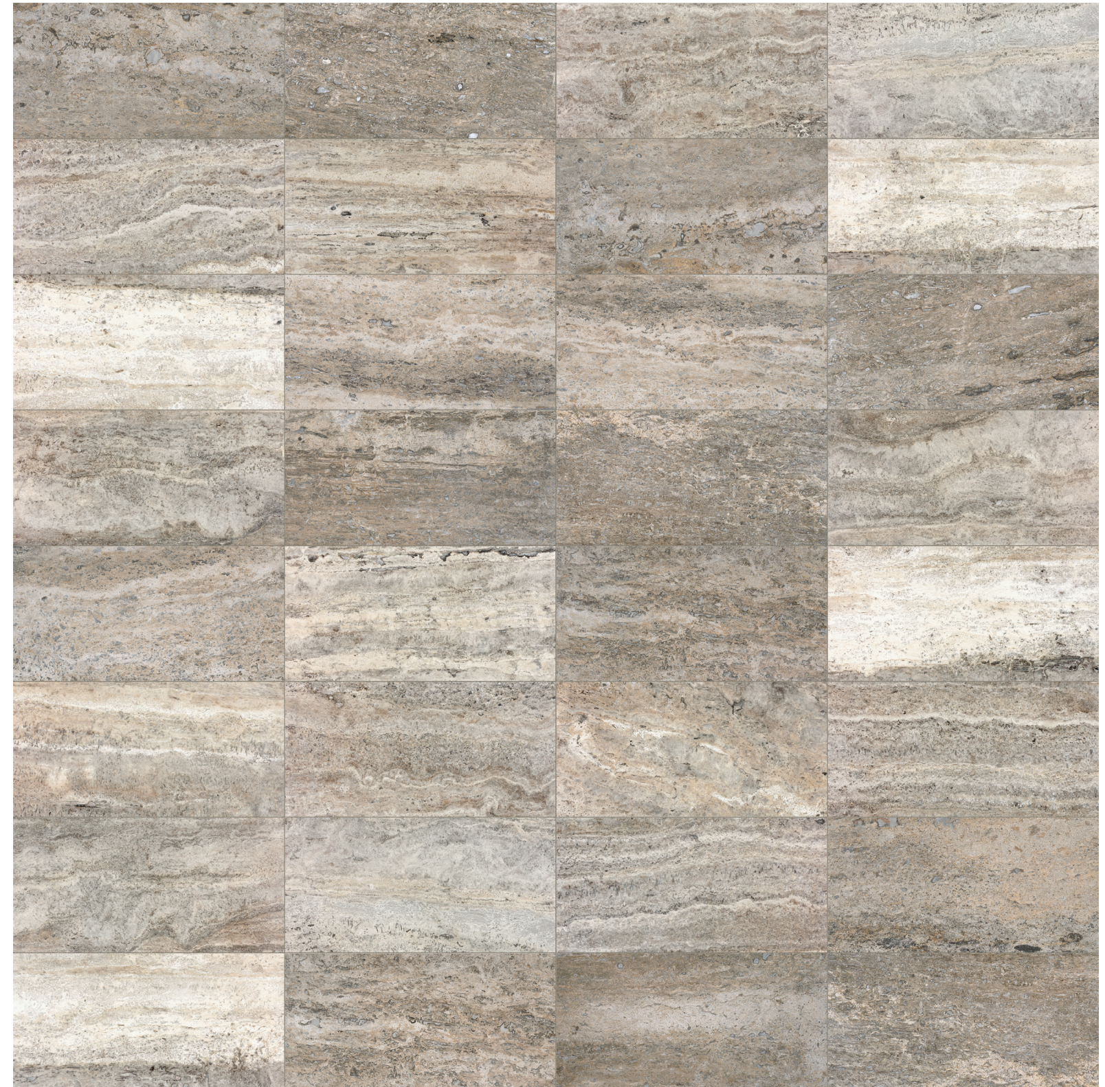
12 x 24 in / 30.5 x 61 cm tile variations

The inherent beauty of natural stone products is expressed through variations in color, texture, shading and veining.