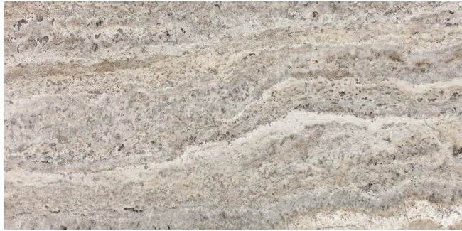
18 x 36 in / 45.7 x 91.4 cm Filled & Honed 5000-0393-0