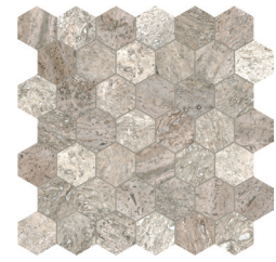
2 in / 4.9 cm Hexagon Mosaic Filled & Honed 5001-0315-0