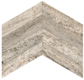
2 x 8.5 in / 5.3 x 21.3 cm Chevron Mosaic Filled & Honed 5001-0316-0