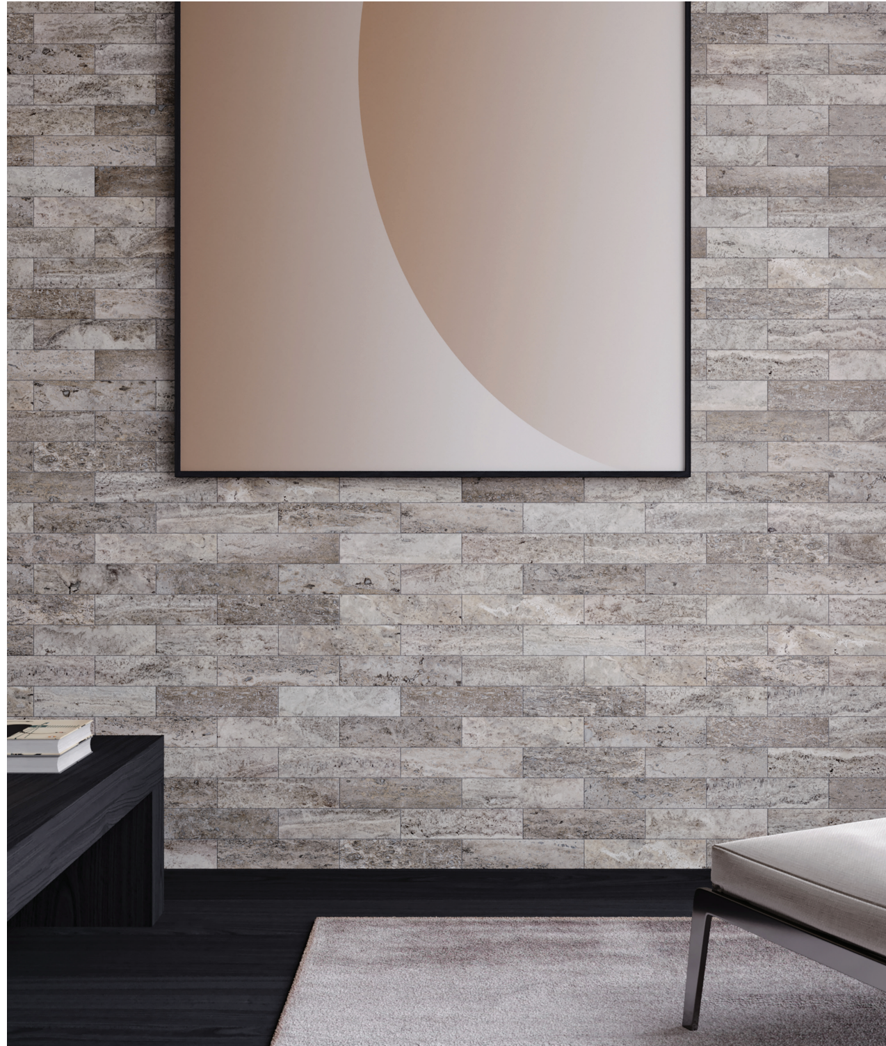
3 x 12 in / 7.5 x 30.5 cm Silver Ash Filled & Honed Travertine Tile