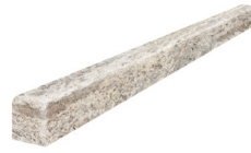
1/2 x 12 in / 1.3 x 30.5 cm Deco-Bar Filled & Honed 5002-0125-0