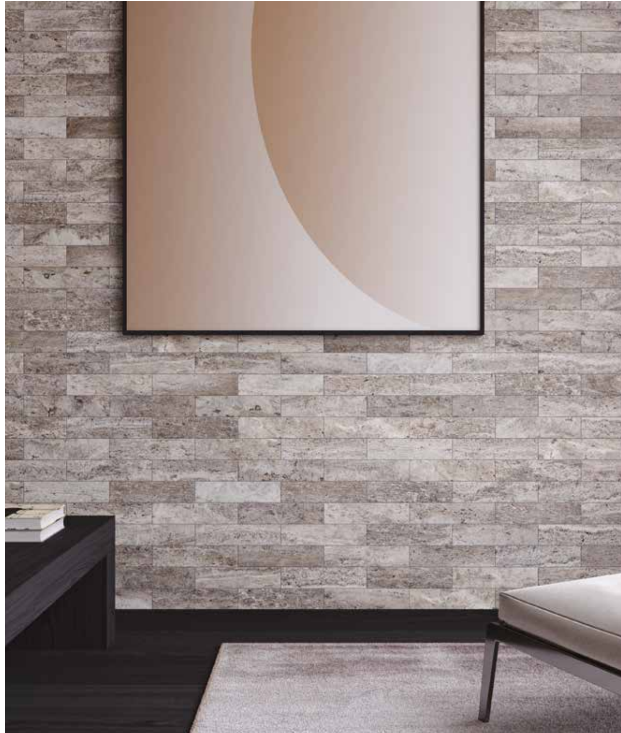
3 x 12 in / 7.5 x 30.5 cm Silver Ash Filled & Honed Travertine Tile