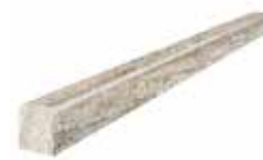
1/2 x 12 in / 1.3 x 30.5 cm Deco-Bar Filled & Honed 5002-0125-0