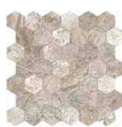
2 in / 4.9 cm Hexagon Mosaic Filled & Honed 5001-0315-0