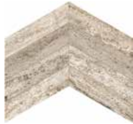
2 x 8.5 in / 5.3 x 21.3 cm Chevron Mosaic Filled & Honed 5001-0316-0