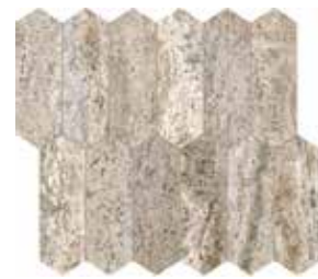
2 x 6 in / 4.9 x 15 cm Picket Mosaic Filled & Honed 5001-0317-0