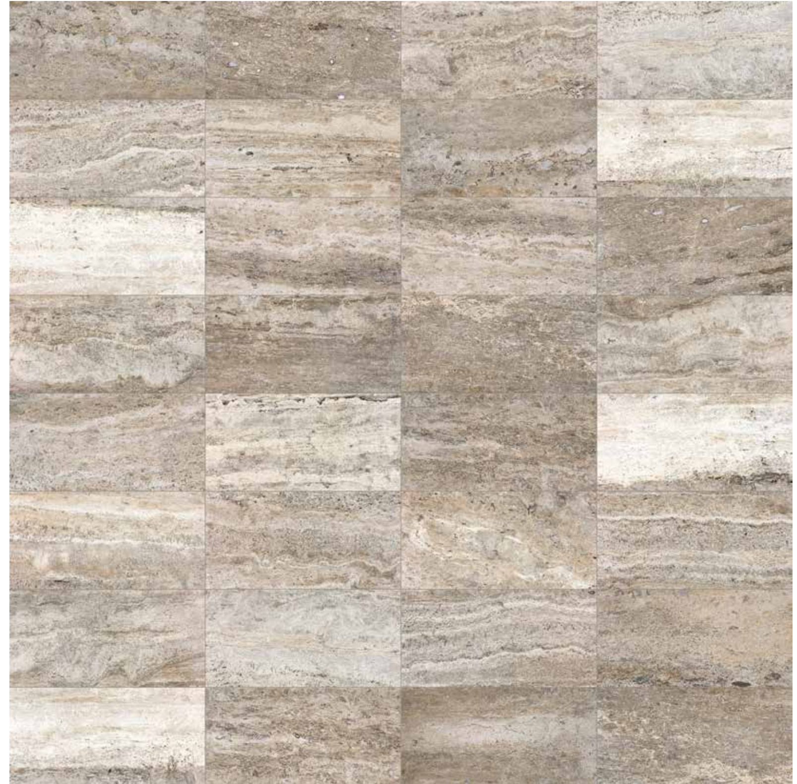
18 x 36 in / 45.7 x 91.4 cm tile variations

The inherent beauty of natural stone products is expressed through variations in color, texture, shading and veining.