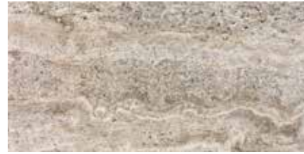
12 x 24 in / 30.5 x 61 cm Filled & Honed 5000-0232-0