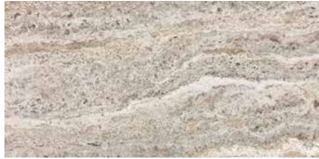
18 x 36 in / 45.7 x 91.4 cm Filled & Honed 5000-0393-0