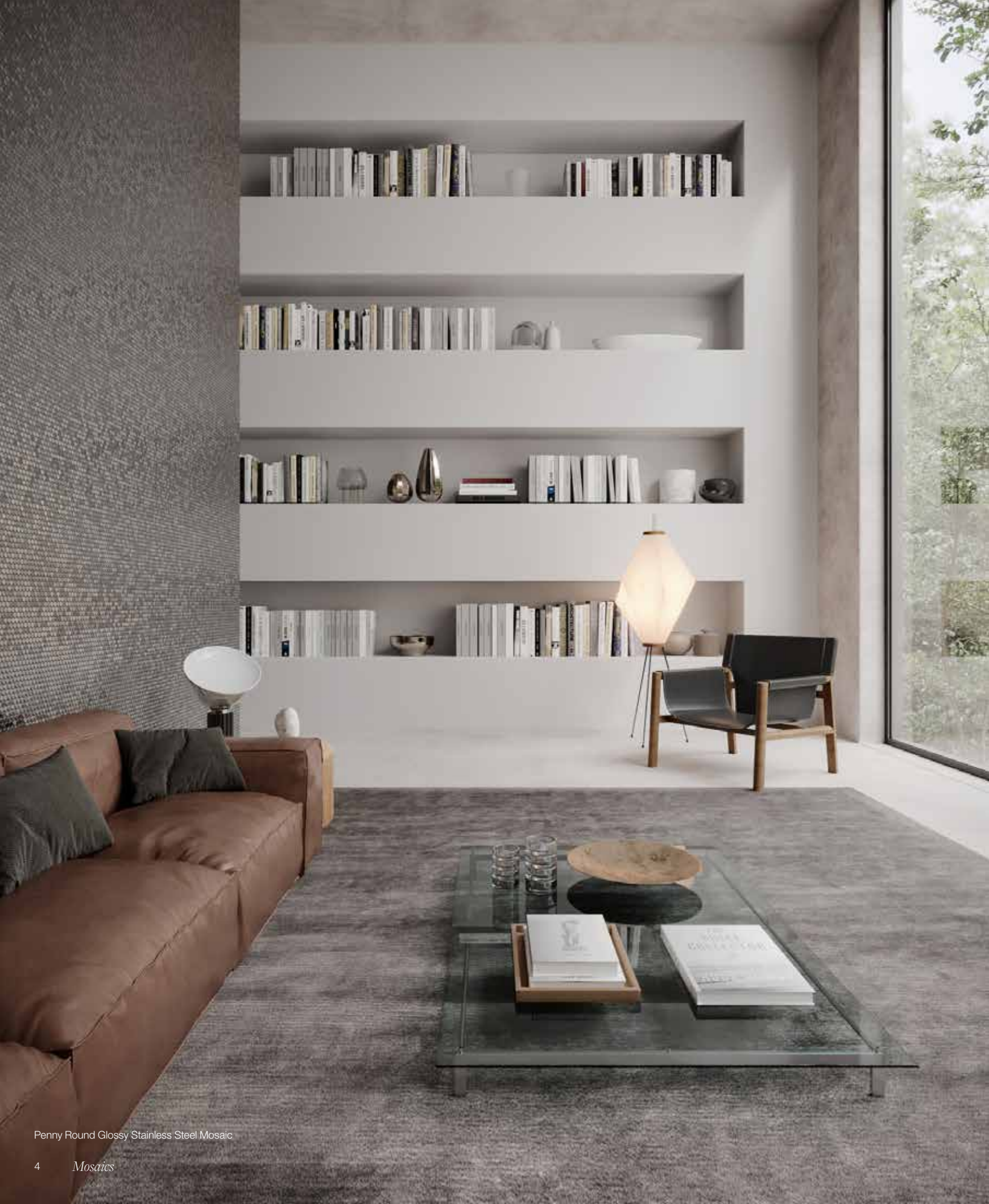
Penny Round Glossy Stainless Steel Mosaic