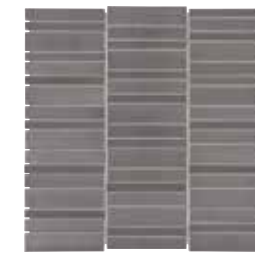
Random Stacked Mosaic Glossy 6001-0024-0