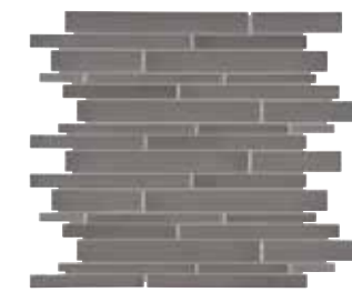
Random Strip Mosaic Glossy 6001-0025-0