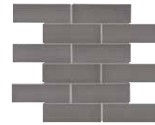
2 x 6 in / 5 x 15 cm Brick Mosaic Glossy 6001-0021-0