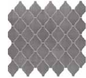
Lantern Mosaic Glossy 6001-0022-0